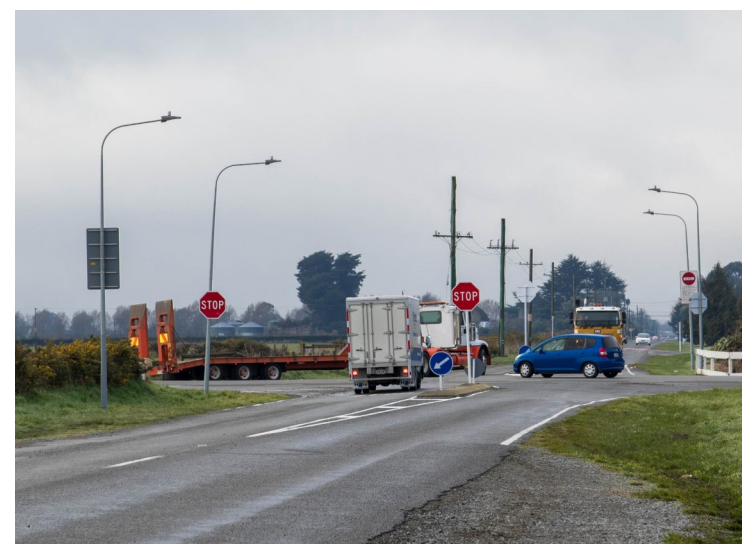
We are also proposing a speed threshold (different road material) on Pound Road just north of the intersection with Ryans Road.

Samantha.sharland@ccc.govt.nz For SH73: CanterburySNP@nzta.govt.nz