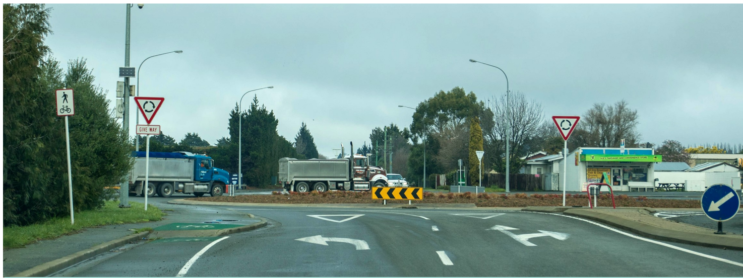
Roundabout at Pound Road and Yaldhurst Road