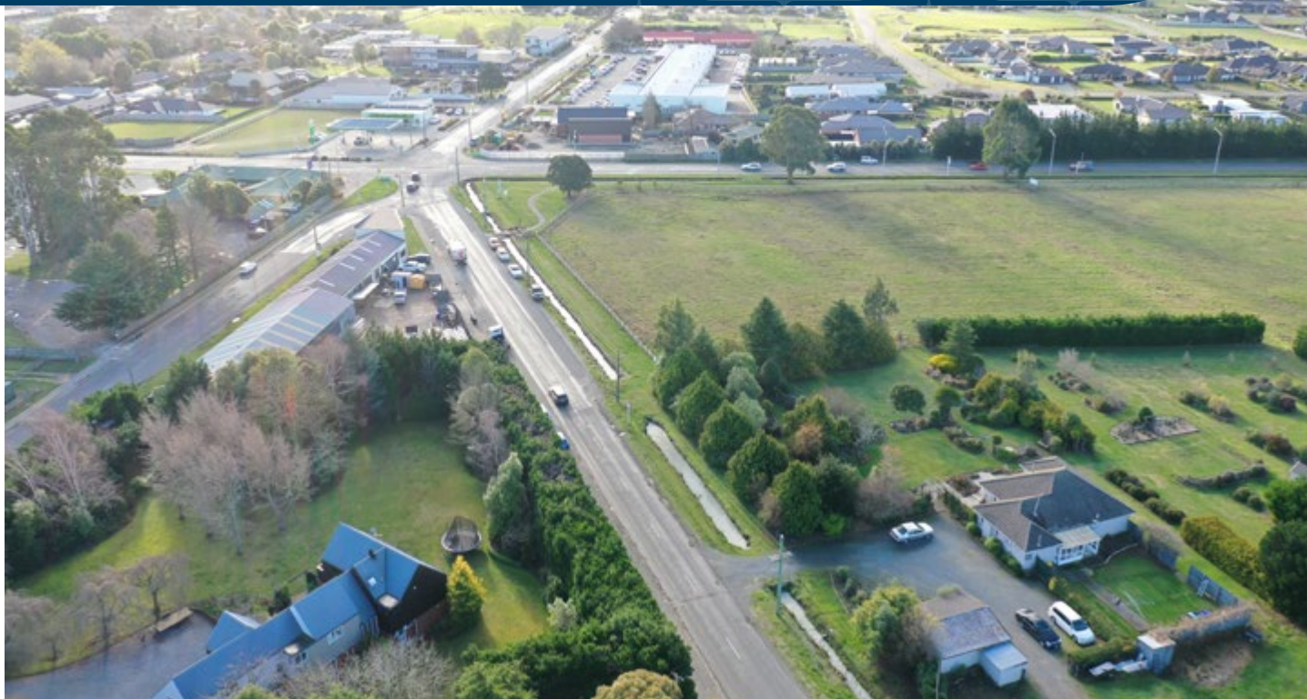
SH73/Weedons Ross Road intersection looking north