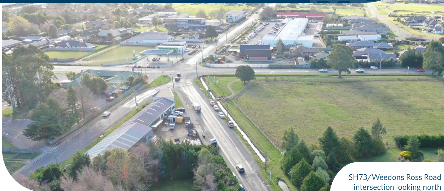
SH73/Weedons Ross Road intersection looking north