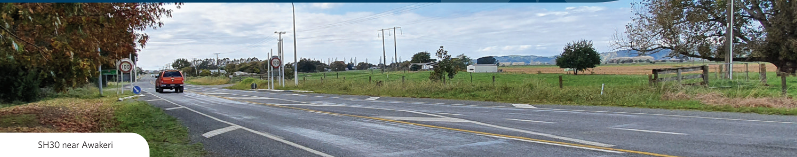
SH30 near Awakeri