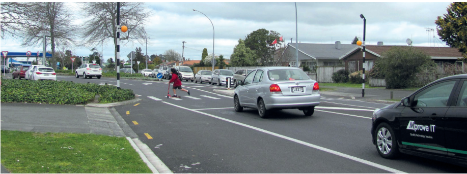
Looking south towards Normandy Avenue roundabout. Traffic lights are planned to replace the zebra crossing here and around the corner on Normandy Avenue.

Similarly, it is proposed that a combination of on-road cycle lanes and sealed shoulders will be created for commuting cyclists, managed with parking restrictions during traffic peak periods.