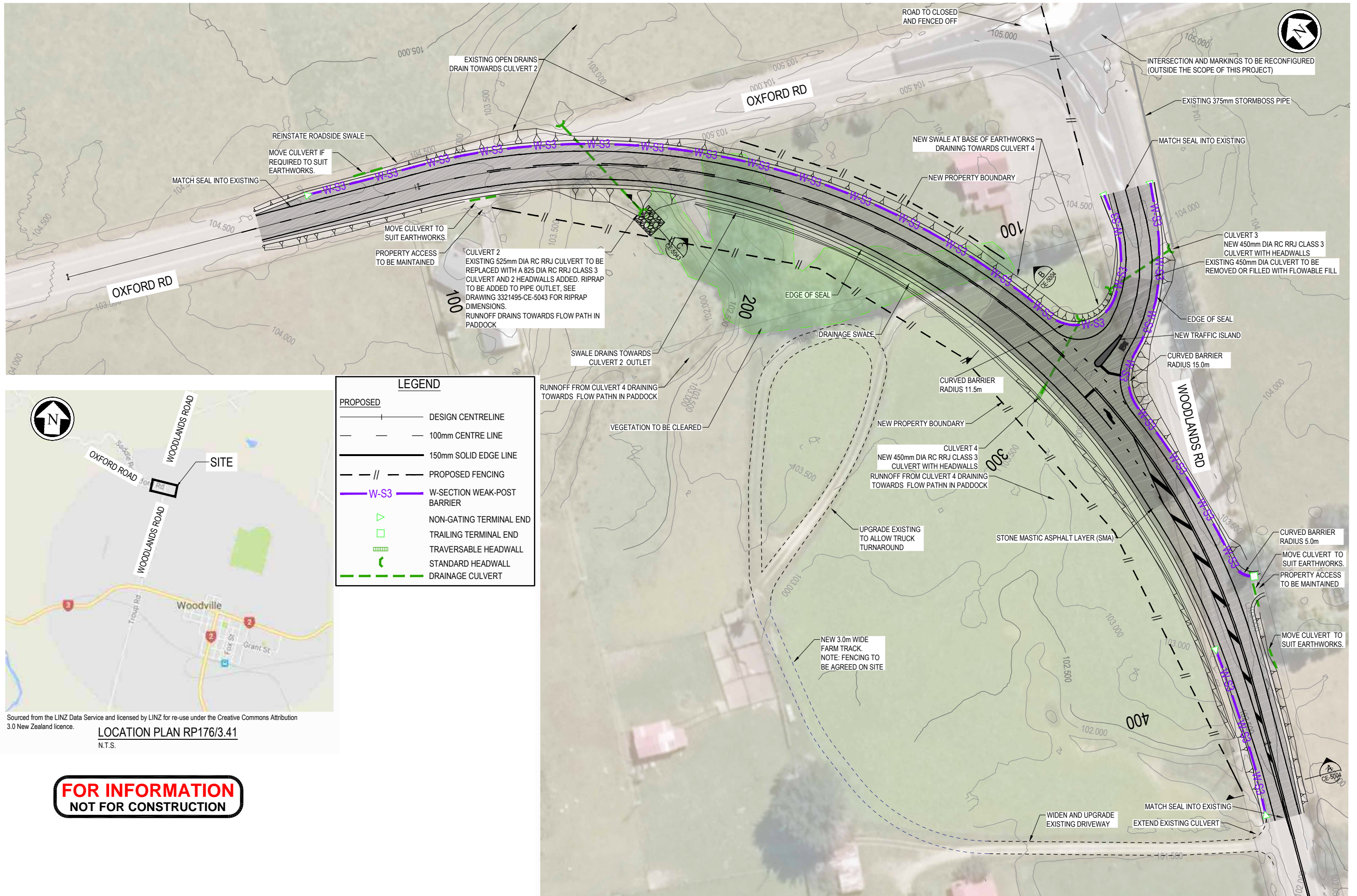
SITE SKETCH PLAN - OXFORD ROAD WOODLANDS ROAD INTERSECTION PRODUCED FOR CONSULTATION PURPOSES ONLY SCALE 1:500