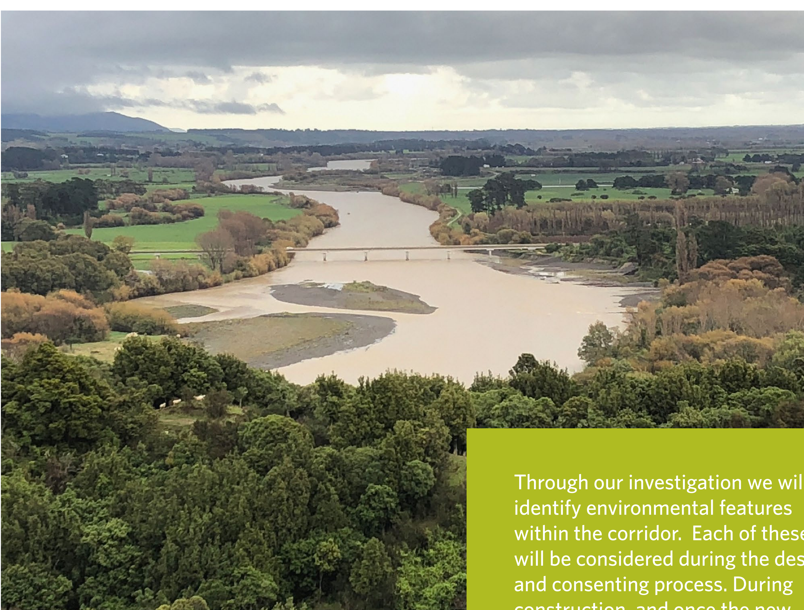
Ensuring the ecological stability of our precious land