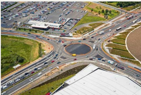
The Landing Drive roundabout in November 2017. Construction of the new road is underway

During the holiday season, there will be a significant increase in visitors to and from Auckland which means more road users, many of whom will be unfamiliar with the route. If you are travelling to Auckland Airport, remember to allow extra travel time and to check road conditions before you leave home.