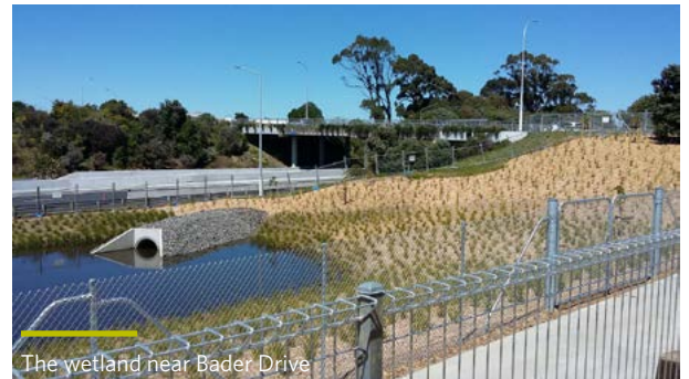
The wetland near Bader Drive