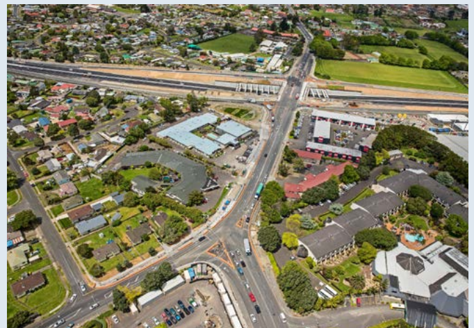
Aerial view of Kirkbride Road in October 2017