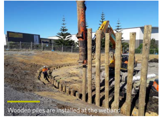
Wooden piles are installed at the wetland

182 piles were installed at the Montgomery Road wetland site late in November, after about 5900 cubic metres of soil was excavated. Once finished, the wetland will look similar to those near Bader Drive and Kirkbride Road.