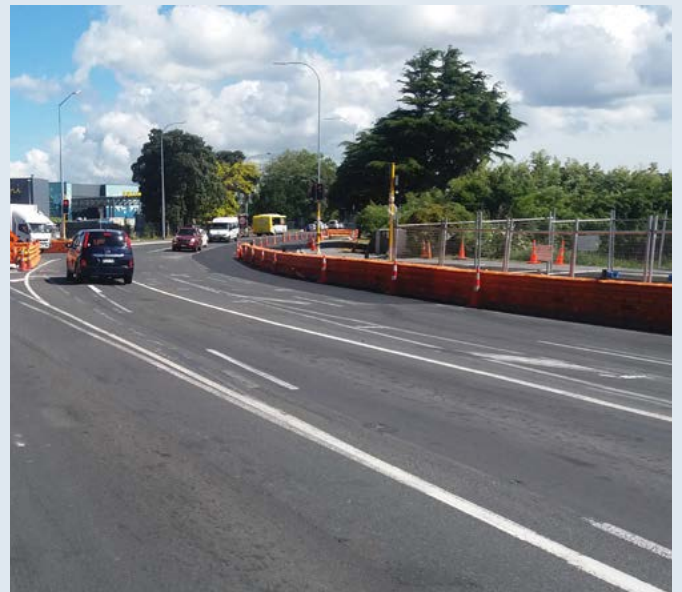
The intersection of Kirkbride Road and Ascot Road, November 2017

The pedestrian crossing at Ascot Road and Kirkbride Road will also open in February.