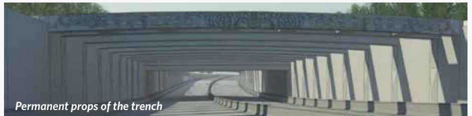
Permanent props of the trench