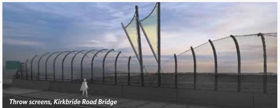
Throw screens, Kirkbride Road Bridge