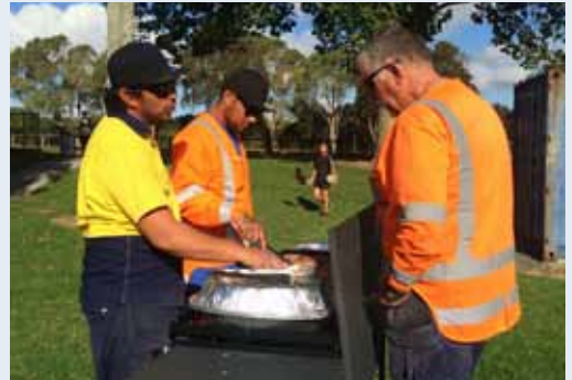
Neighbourhood BBQ at Williams Park April 2015

Neighbourhood BBQs were held on Killington Crescent, Viscount Street, Westney Road and Kirkbride Road in March/April 2015. These free community events are a great way for us to meet our neighbours and let the community know what's happening on SH20A. We'll be rolling the BBQ out again later this year so look out for invitations in your letterbox, or sign up to our Stay in Touch database so you don't miss out.