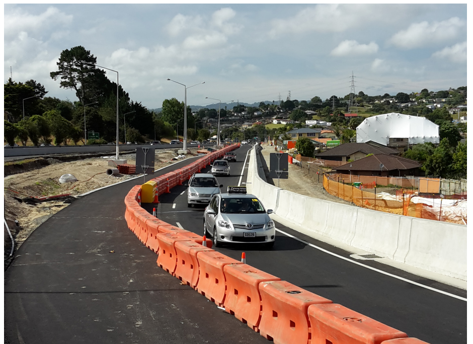
The new Royal Road off-ramp

The new Royal Road off-ramp is now open to traffic. It's more than twice as long and holds more vehicles, reducing queuing on the motorway at peak times. It will improve traffic flow through to Westgate once the Waterview tunnel opens in April. The off-ramp will be widened to two lanes to further increase capacity before it is completed.