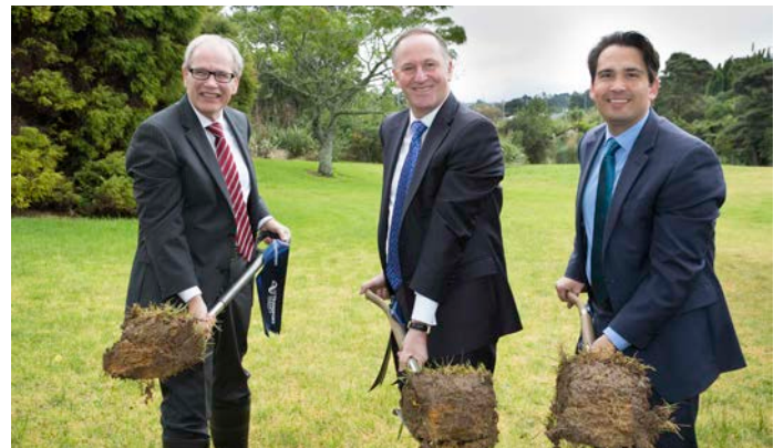
From left to right; Auckland Mayor Len Brown, Prime Minister John Key and Minister of Transport Simon Bridges turning the Sod at Lowtherhurst Reserve, Massey, Friday 8th July 2016.

Hawkins Infrastructure has been awarded the $100 million contract to complete the upgrade. Hawkins is a leader in delivering infrastructure projects in New Zealand.