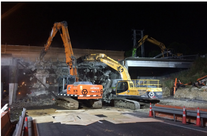
The hydraulic jaws munching Huruheru Bridge.