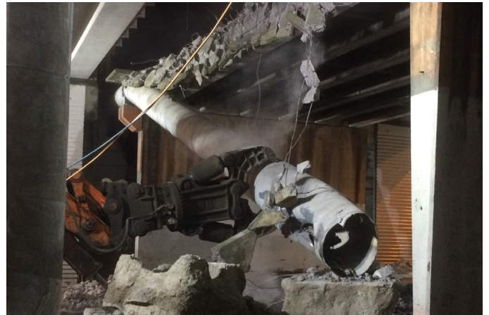
Removing the old watermain on Royal Road Bridge.