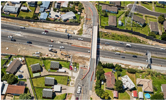
Huruheru Bridge after demolition works with part of the new bridge open to traffic.

We would like to thank all our neighbours for their patience and support especially during the demolition works.