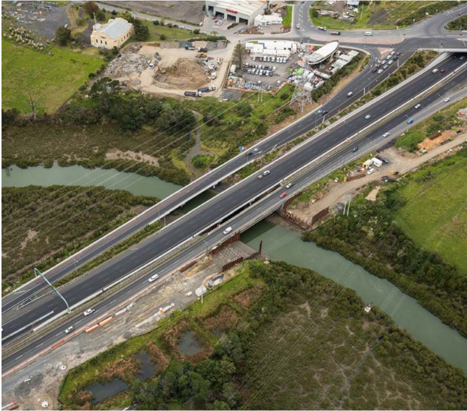
Construction of the new Lincoln Road on-ramp to SH16 heading north.