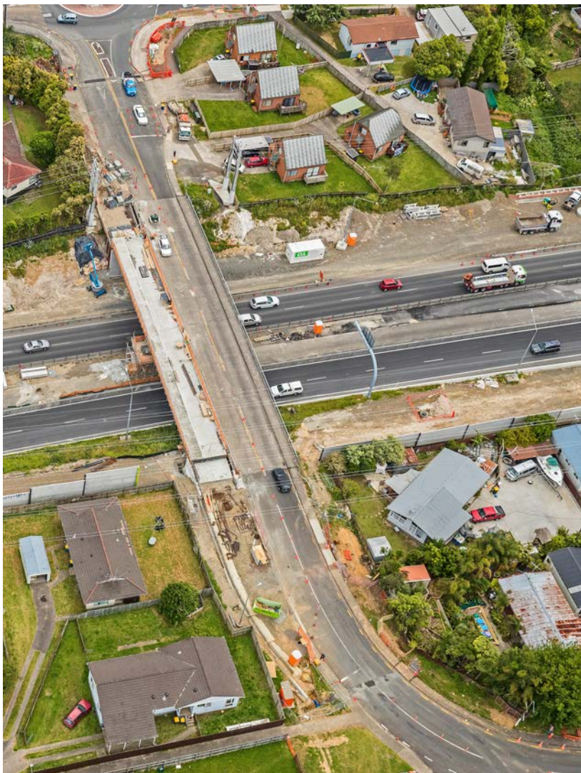
Huruhuru Bridge takes shape.