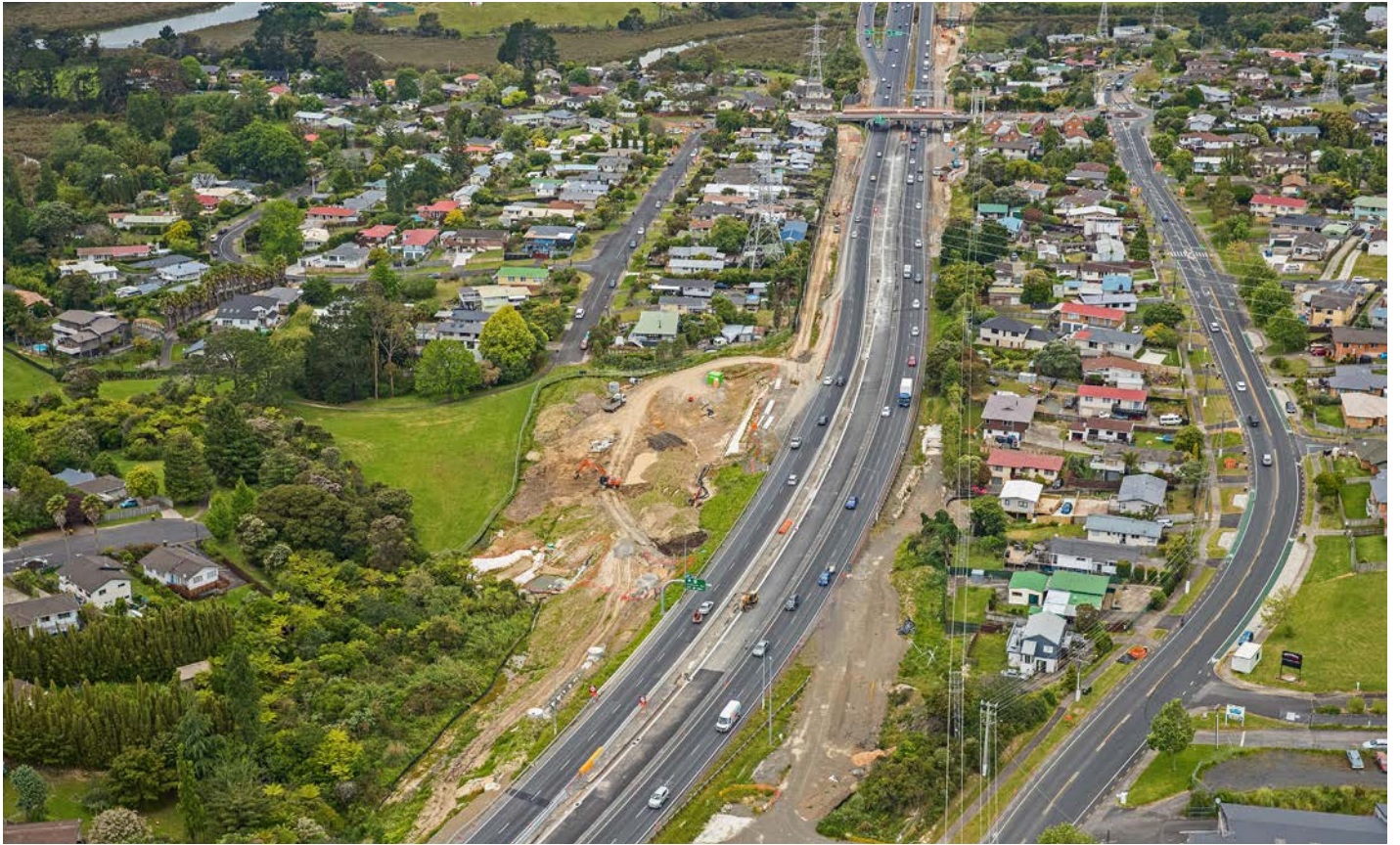
Work is underway to widen the motorway and create a wetland in Lowtherhurst Reserve.