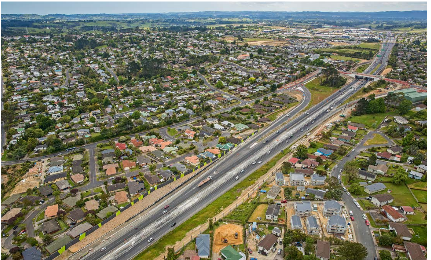
The Royal Road off ramp.