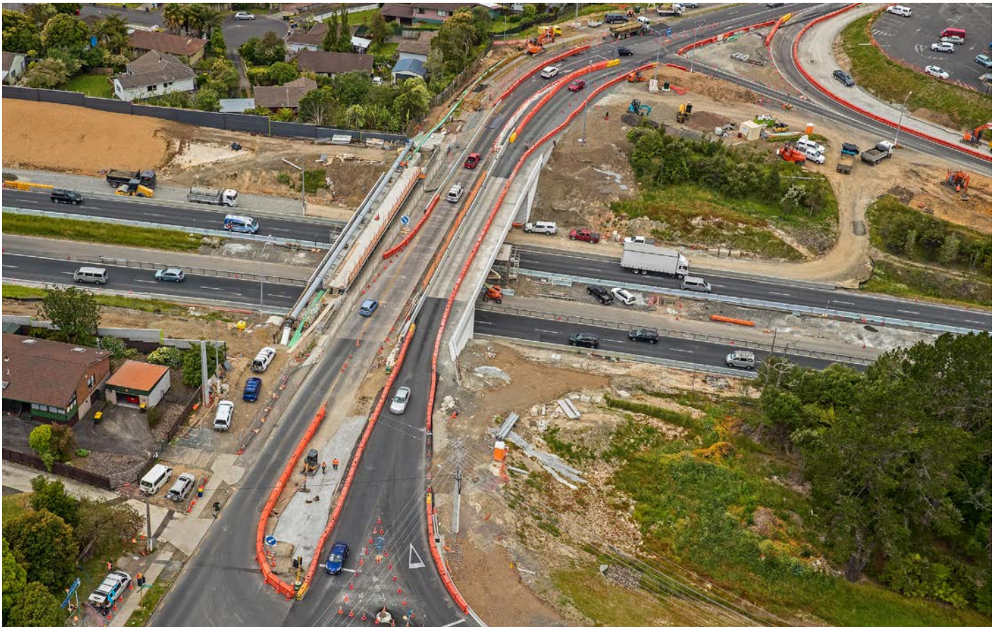
Royal Road Bridge - new bridge is on the right and the old structure in the middle is to be demolished.