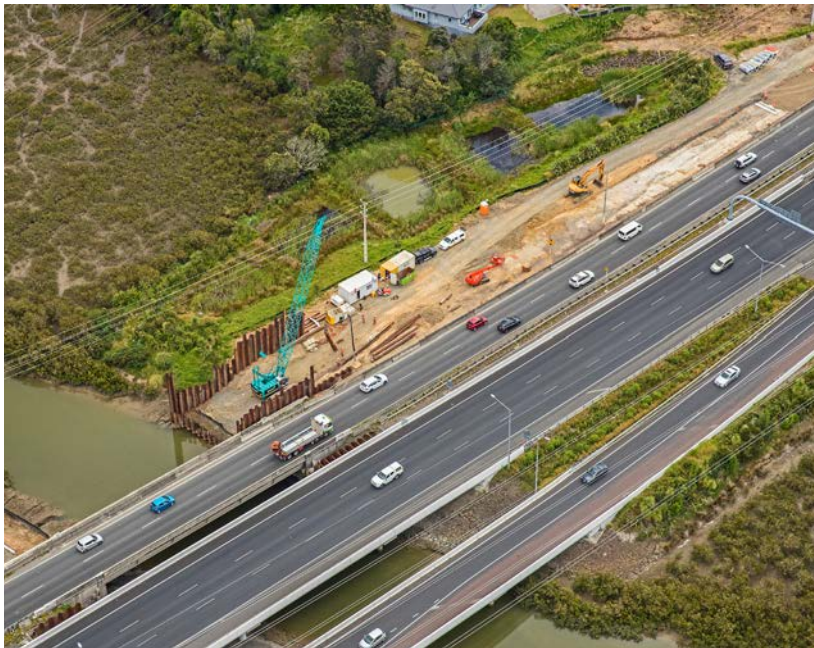
Piling gets underway for the new Lincoln to Westgate on ramp.