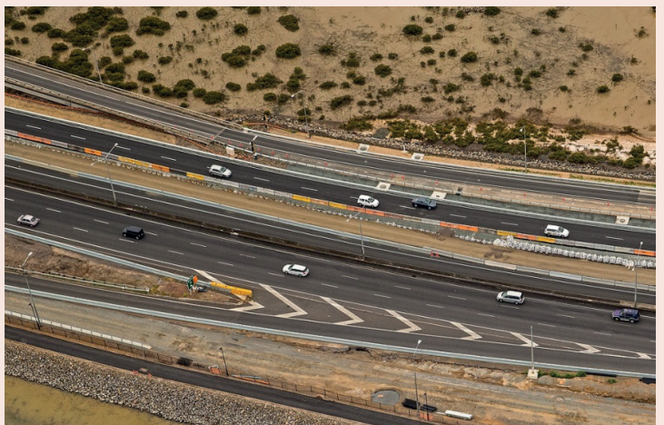
December 2015 Lane 2 is up and the project team is now preparing to raise lane 3.