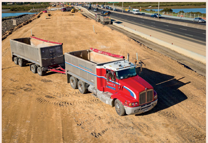
September 2014 Looking from Rosebank Road citybound along the newly raised stretch that will become new lanes.