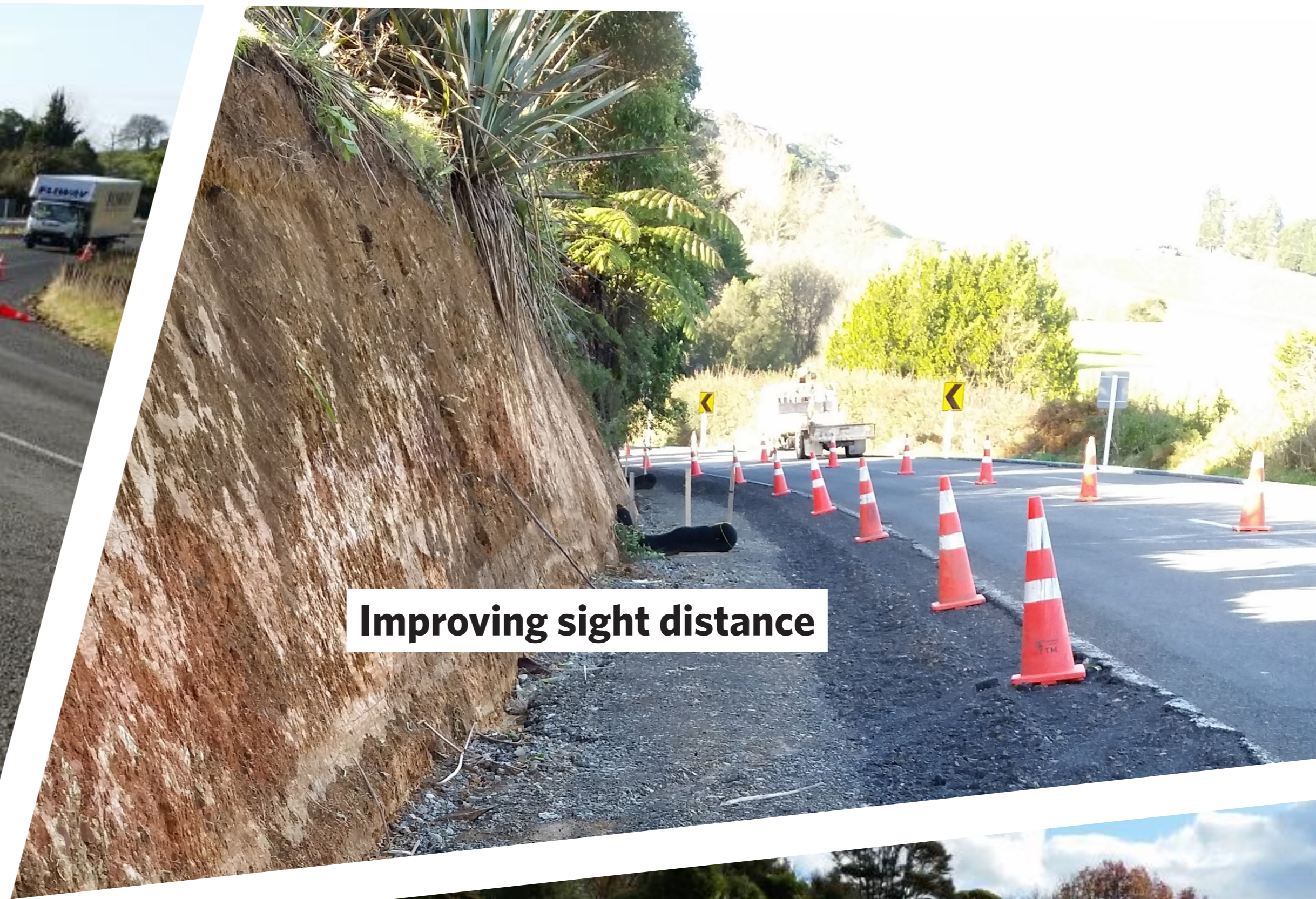
Improving sight distance