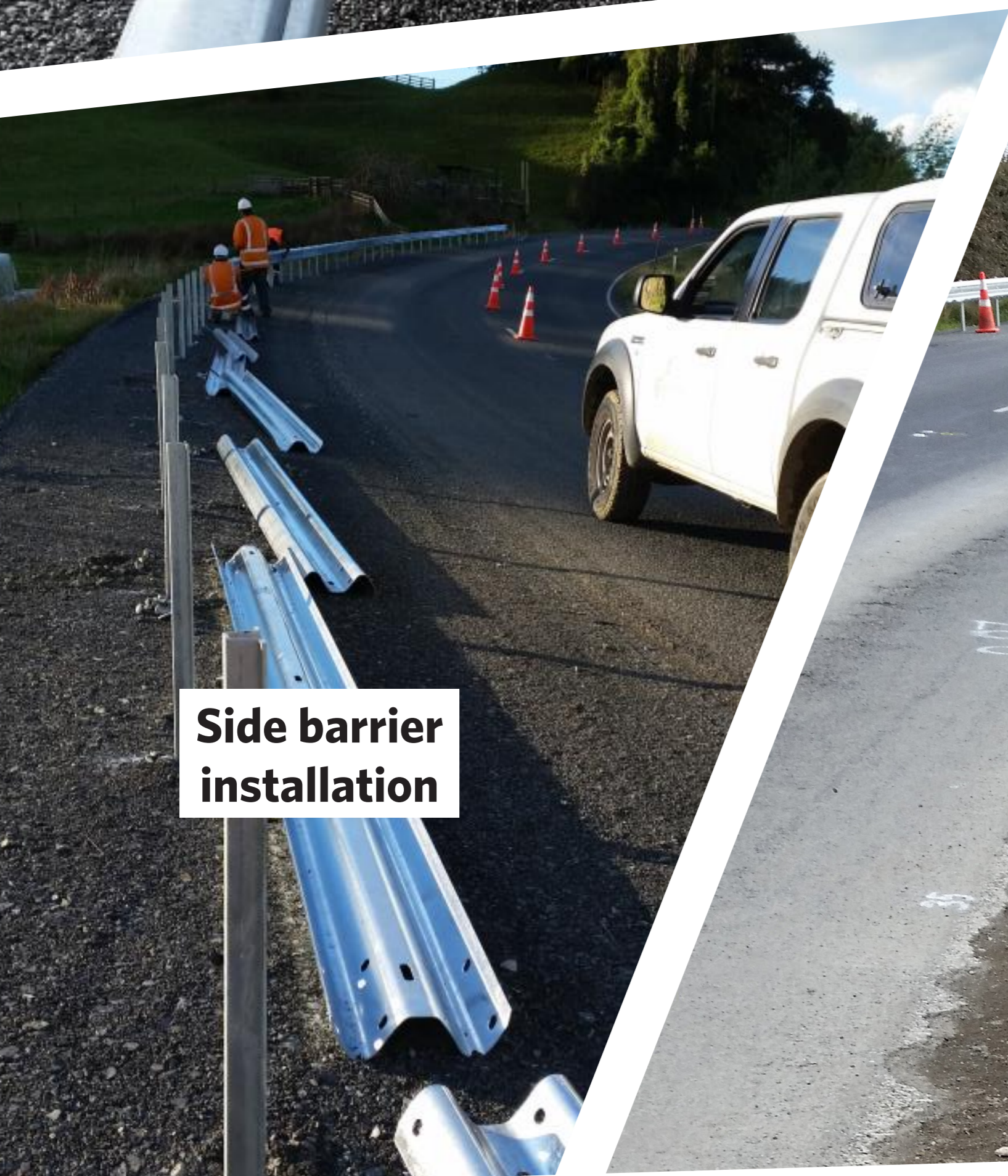
Side barrier installation