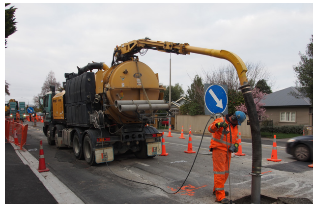
Example of hydro-excavation

We apologise for any inconvenience this might cause.