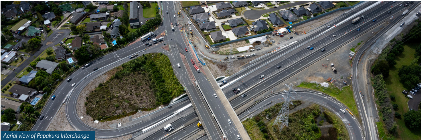
Aerial view of Papakura Interchange