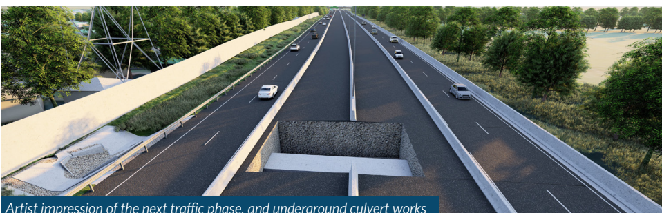
Artist impression of the next traffic phase, and underground culvert works