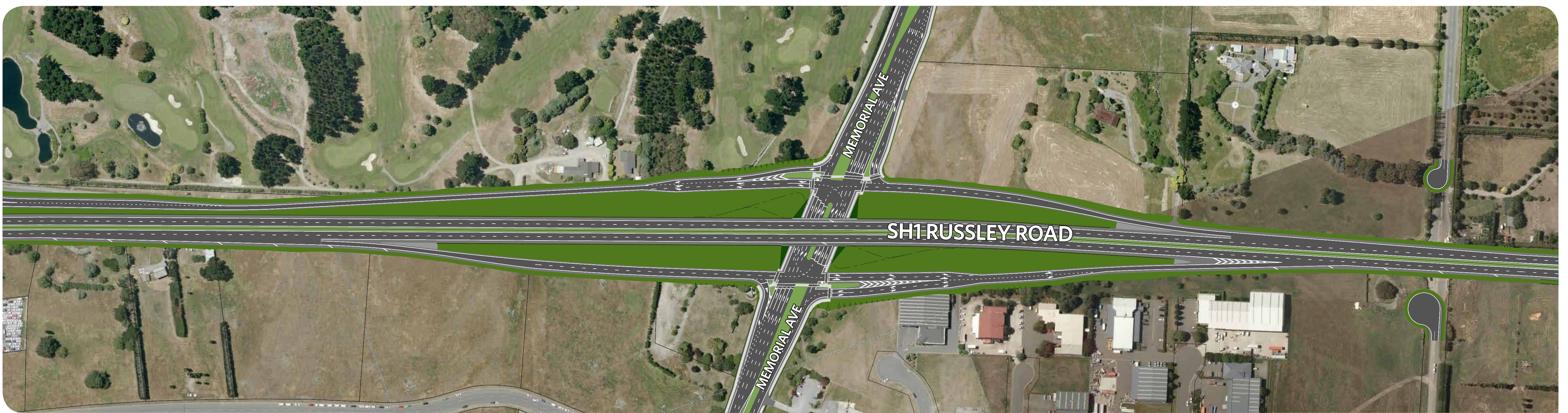
Memorial Avenue/Russley Road Interchange