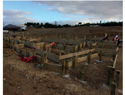
Working on the main paa site

The crew has completed the installation of all posts for the main paa and is currently completing the cladding. Work on the two outposts will begin over the next few weeks.