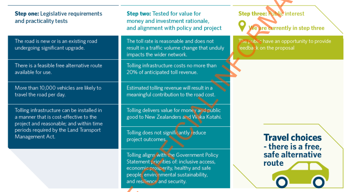
Table 1: The three-step process for Waka Kotahi tolling assessment.

Waka Kotahi has a three-step process to follow when assessing whether a road will be tolled or not. This public consultation and feedback report concludes the third and final step in this process.