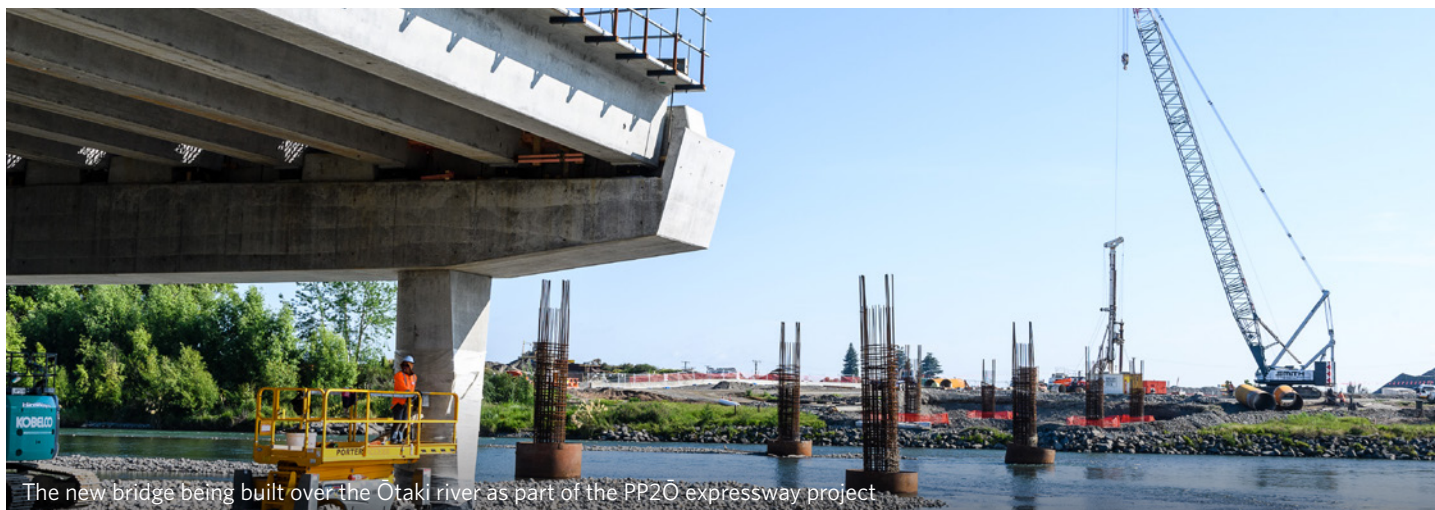
The new bridge being built over the Ōtaki river as part of the PP2Ō expressway project

In May 2019, the PP2Ō Revocation team gathered community and stakeholder feedback on the revocation of State Highway 1 between Peka Peka and Ōtaki. This information will be used to determine the scope of the work and help us develop concept designs for the project.