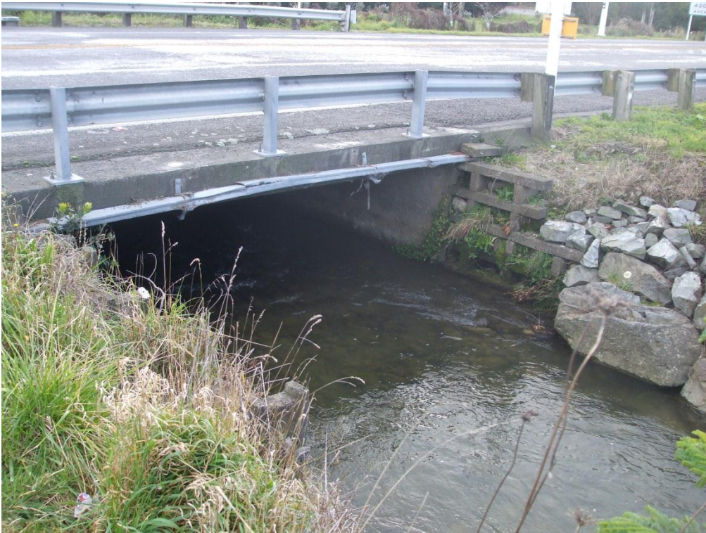
Figure D-3 View of SH1 culvert on main stream channel