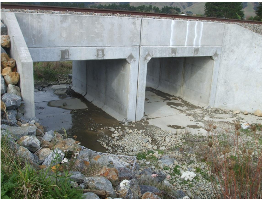
Figure D-6 View of NIMT railway culvert on Mangaone Overflow