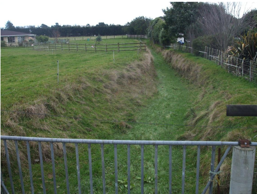
Figure D-8 View of Mangaone Overflow looking downstream from SH1 culvert