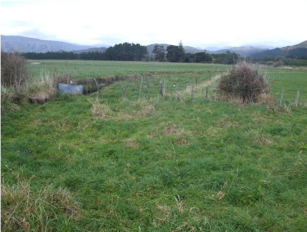
Figure D-1 View of Mangaone Stream floodplain looking upstream from south of NIMT railway culvert on main stream channel