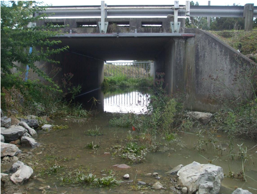
Figure D-7 View of SH1 culvert on Mangaone Overflow