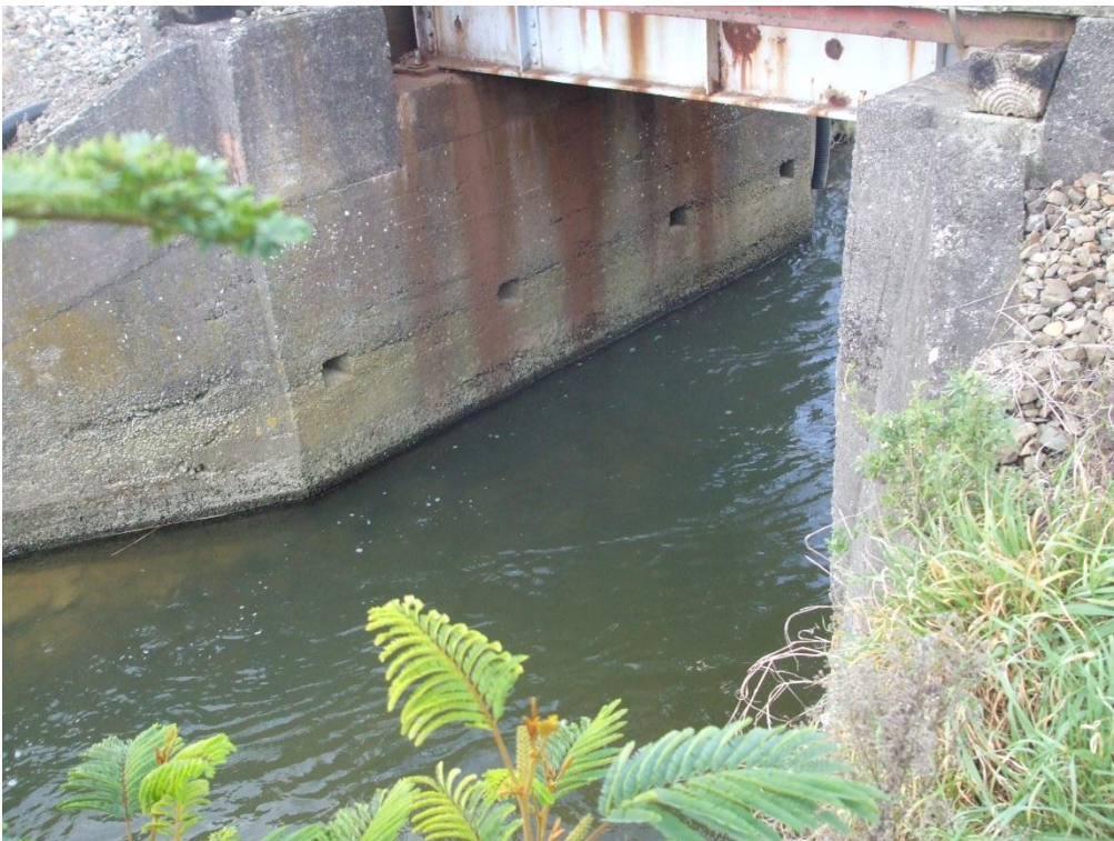
Figure D-2 View of NIMT railway culvert on main stream channel