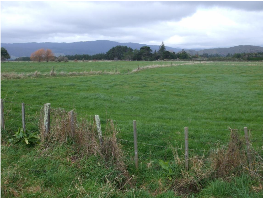
Figure D-5 View of floodplain looking upstream from NIMT railway culvert on Mangaone Overflow