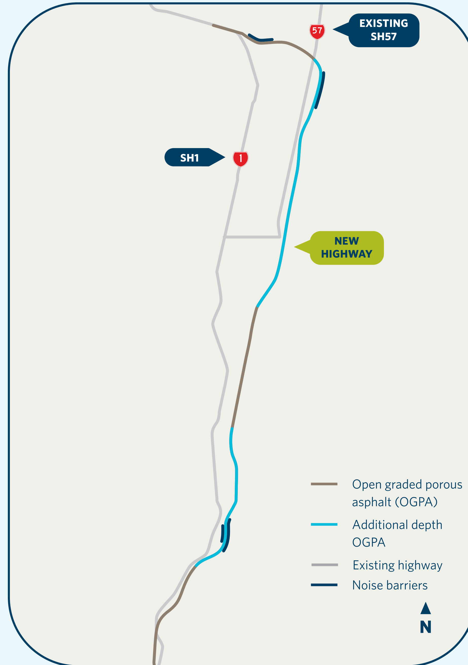
New highway surface map.