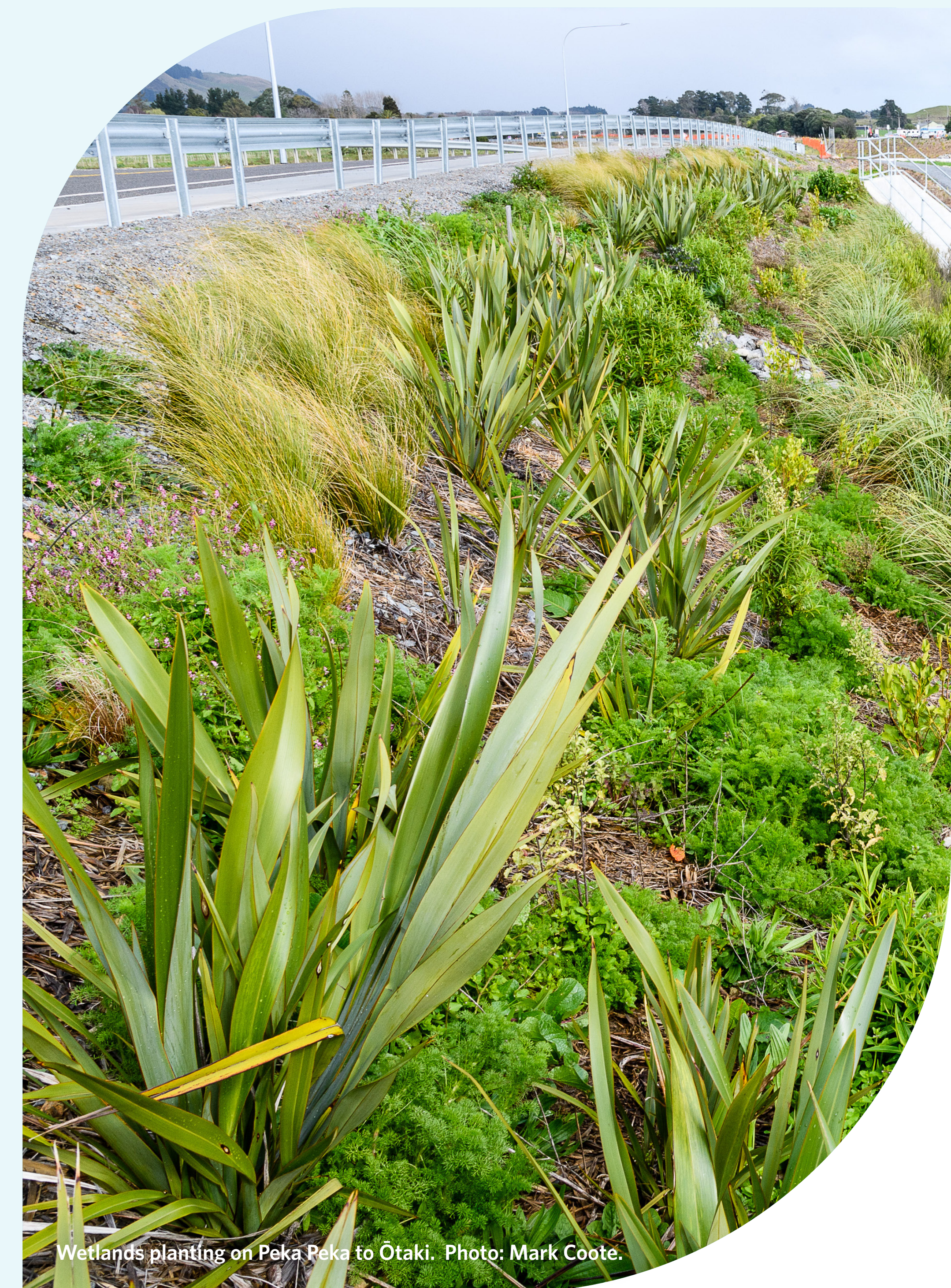
Wetlands planting on Peka Peka to Ōtaki.

The new highway includes numerous culverts and bridges that maintain current flows of water across the road. Culverts are oversized and embedded to allow a naturalised stream bottom to form, providing fish habitat and maintaining current flows rates. In larger storm events, the new highway will throttle some stormwater flow and help reduce potential downstream flooding.