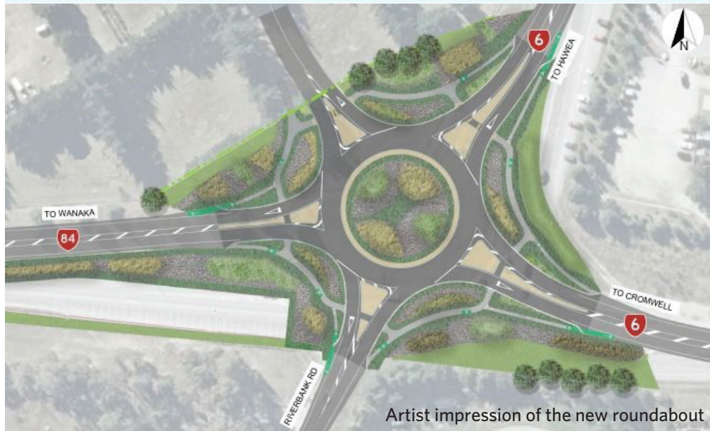
Artist impression of the new roundabout