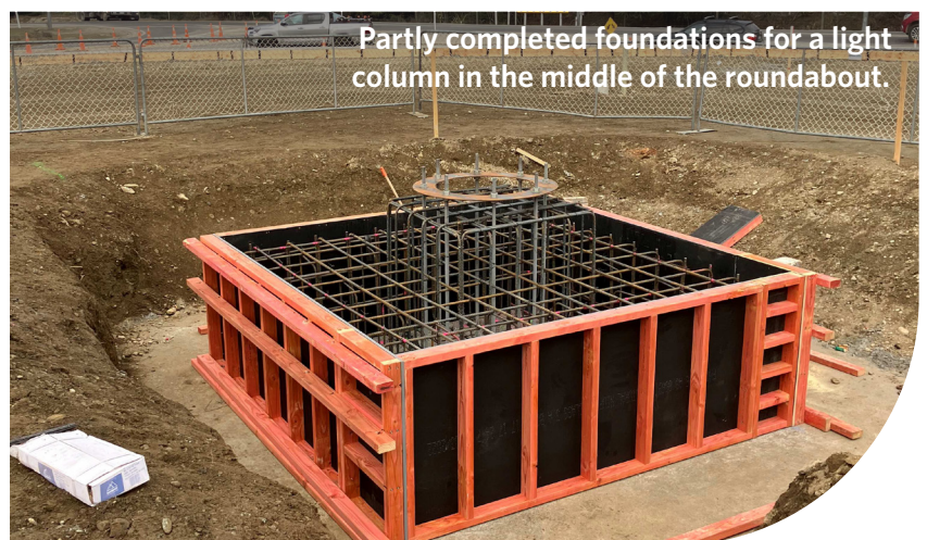
Partly completed foundations for a light column in the middle of the roundabout.