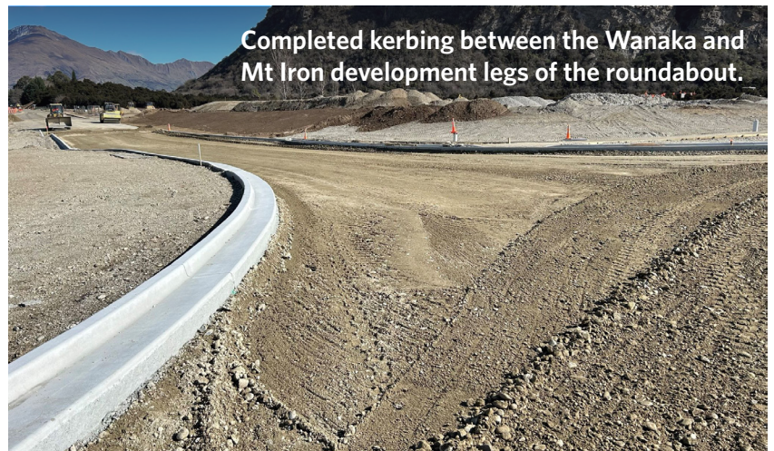
Completed kerbing between the Wanaka and Mt Iron development legs of the roundabout.

Traffic layouts will change often. Take care and allow extra time driving through this area, especially during peak morning and afternoon traffic. Drive carefully, observe the signs, be aware of any hidden traffic queues, and follow the directions of our traffic management crews who are there to keep you safe.