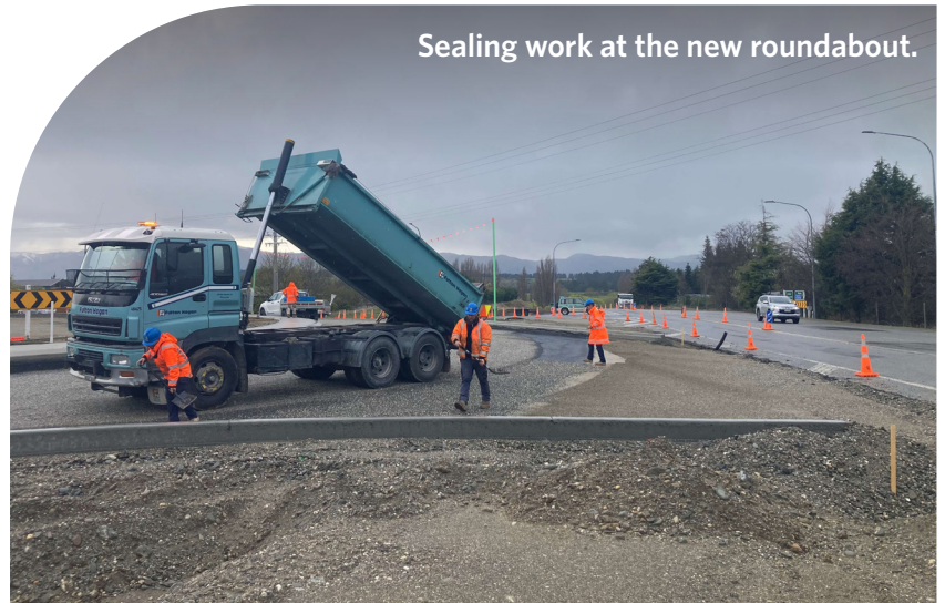
Sealing work at the new roundabout.

Warmer spring weather has seen a start on sealing and asphaltting on both the roundabout and its Wanaka and Hawea approaches. Work is also underway on installing drainage and utility services.