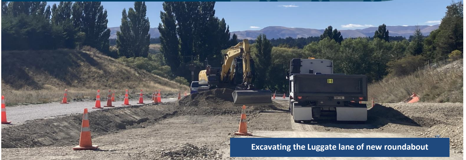
Excavating the Luggate lane of new roundabout

If you've driven through the nearly completed roundabout, you'll know how much easier it is to travel through this busy SH6/SH84 intersection.