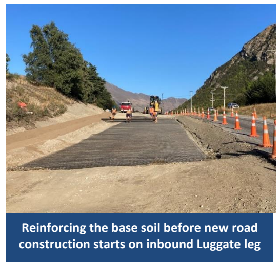
Reinforcing the base soil before new road construction starts on inbound Luggate leg