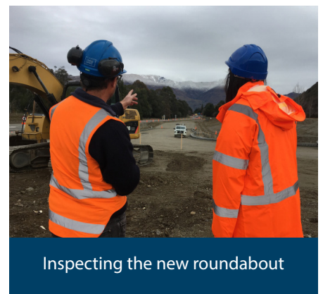
Inspecting the new roundabout