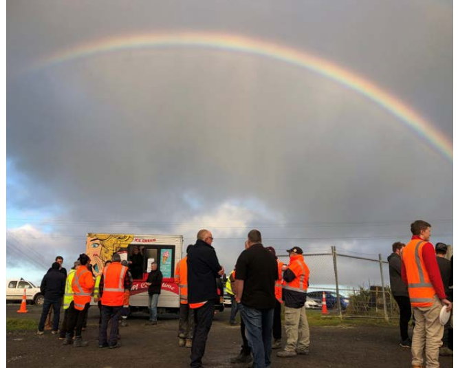
A great start to the day at the crew BBQ breakfast.

Following formalities and waiata, kauri trees were planted on the hill by each of our special guests. The kauri were purchased from the Kauri Museum especially for this event.