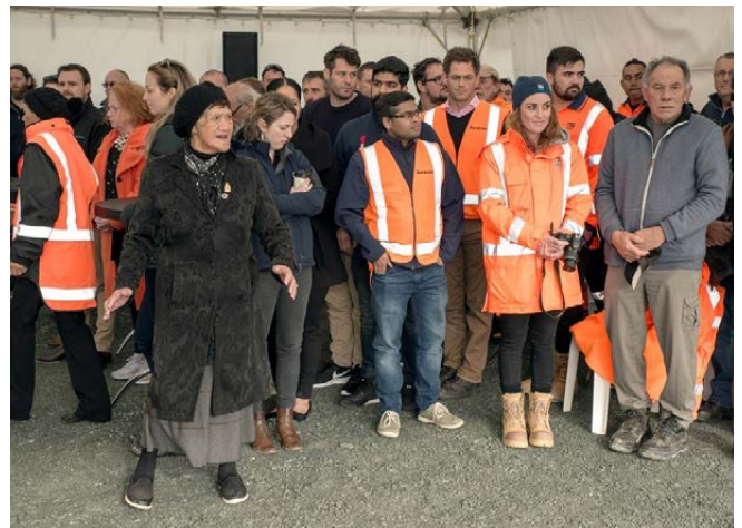
A kuia from Te Uri o Hau welcomes officials into the ceremony.