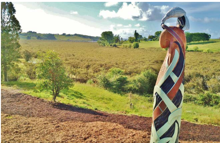
The stunning pou which depicts Manu weaving all the people together.