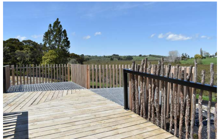
The shared path and boardwalk.