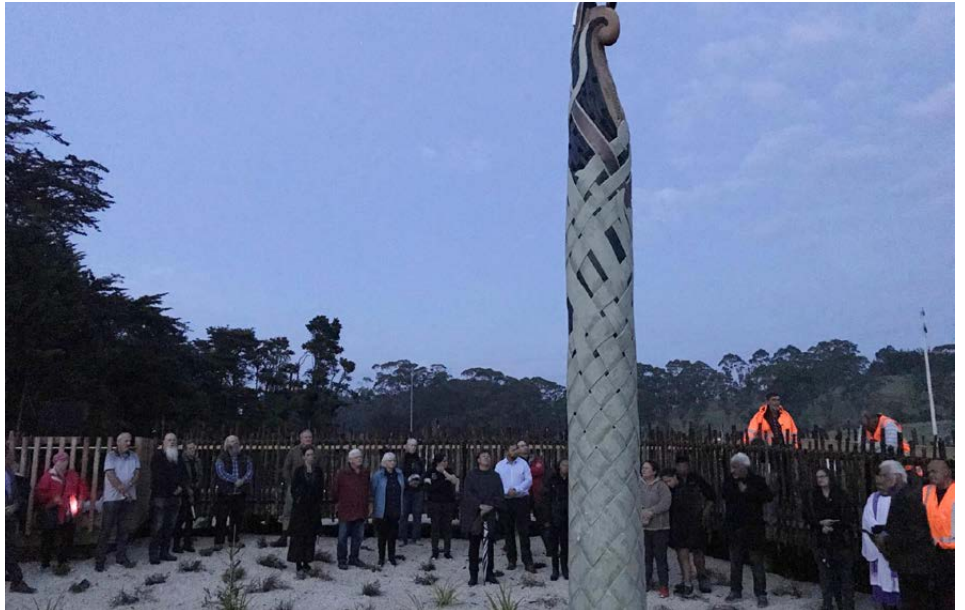
Gathering for the dawn blessing.

About 60 people attended a dawn blessing on Monday 9 December 2019 for the wahi taonga and shared path on the SH12 Matakohe Bridges realignment project. The dawn event blessed the wahi taonga area, including the pou which shows the manu (the white tui) weaving all the people together. The wahi taonga area is located between the two bridges, Piringiatahi and Te Ao Marama Hou.