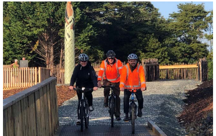
Some of the project team for WSP and Fulton Hogan trying out the new shared path.