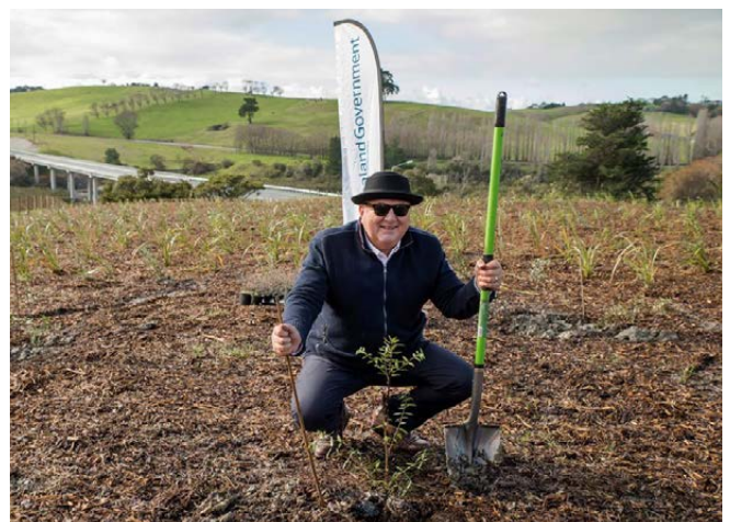
The Hon Shane Jones planting his Kauri tree, with Piringatahi Bridge in the background.