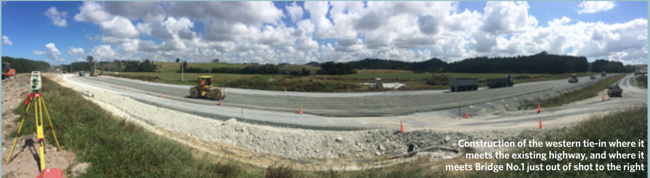
Construction of the western tie-in where it meets the existing highway, and where it meets Bridge No.1 just out of shot to the right