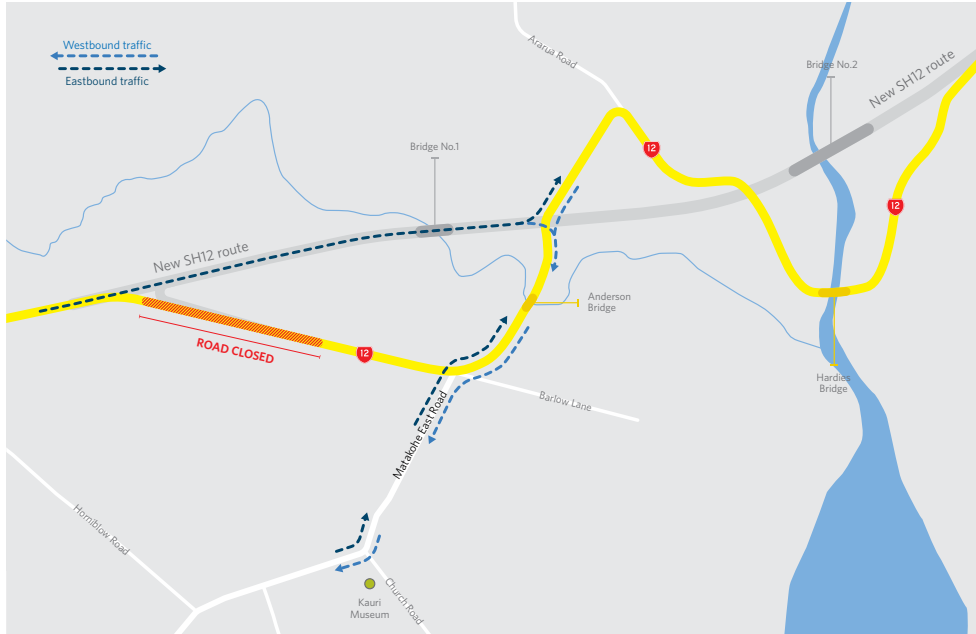
Diversions in place from February 19

THE NEXT STAGE OF DIVERSIONS IS TAKING PLACE SO THAT THE TEAM CAN CONTINUE WITH PAVEMENT WORKS. PLEASE NOTE THE DATES AND DIVERSION ROUTES, SO YOU CAN PLAN YOUR TRAVEL.