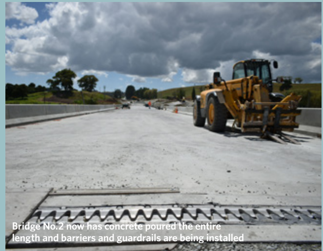
Bridge No.2 now has concrete poured the entire length and barriers and guardrails are being installed