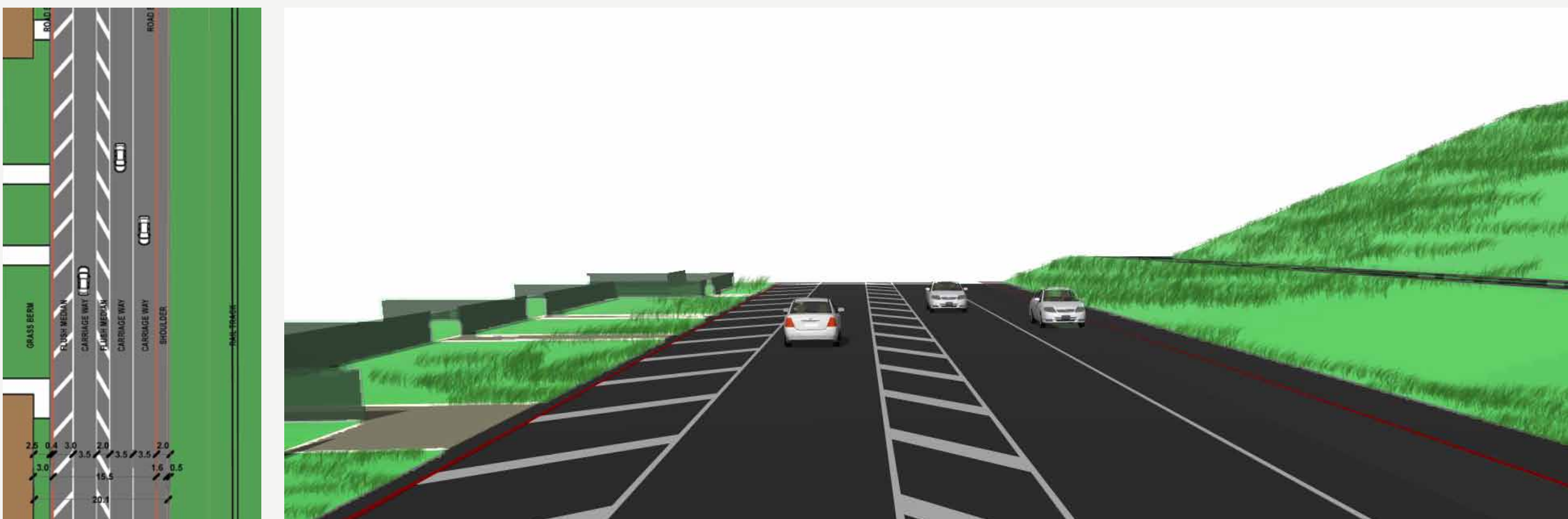
Existing street view