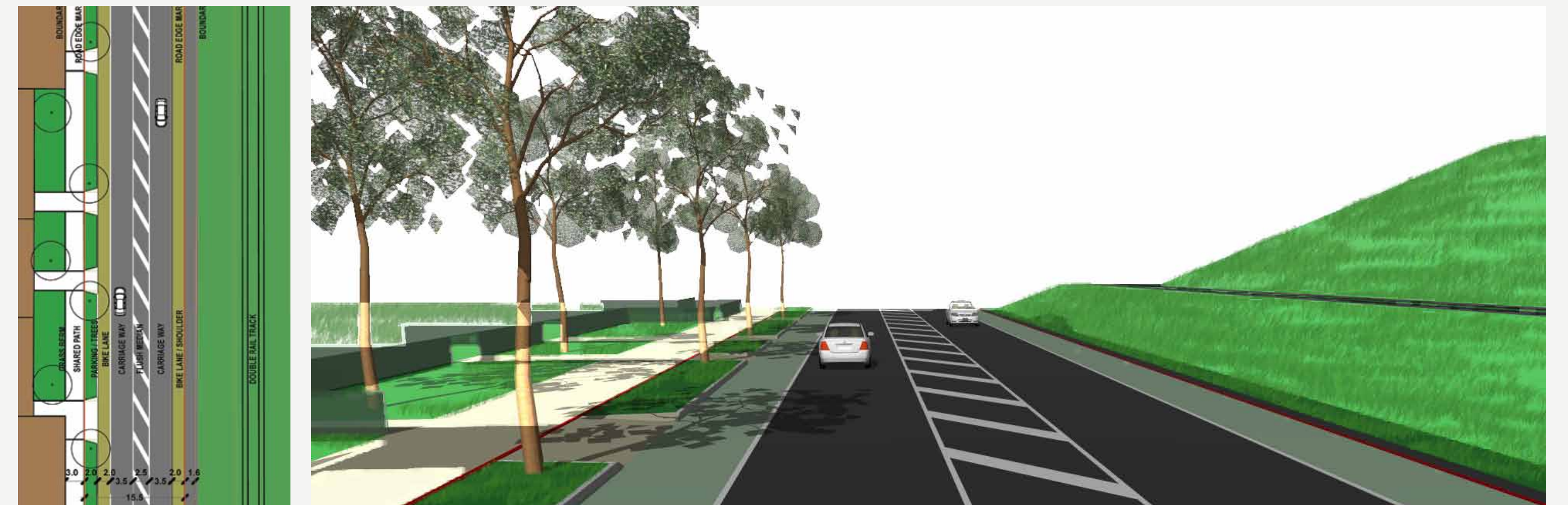
No parking, trees at kerbside