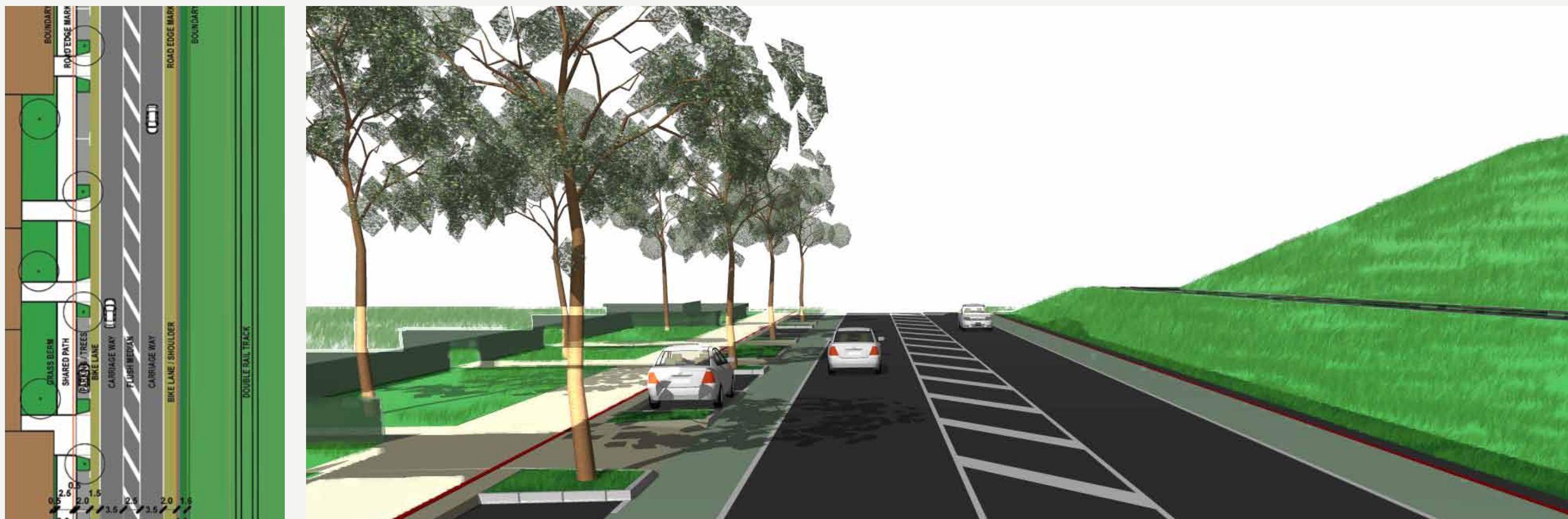
Trees and parking at kerbside