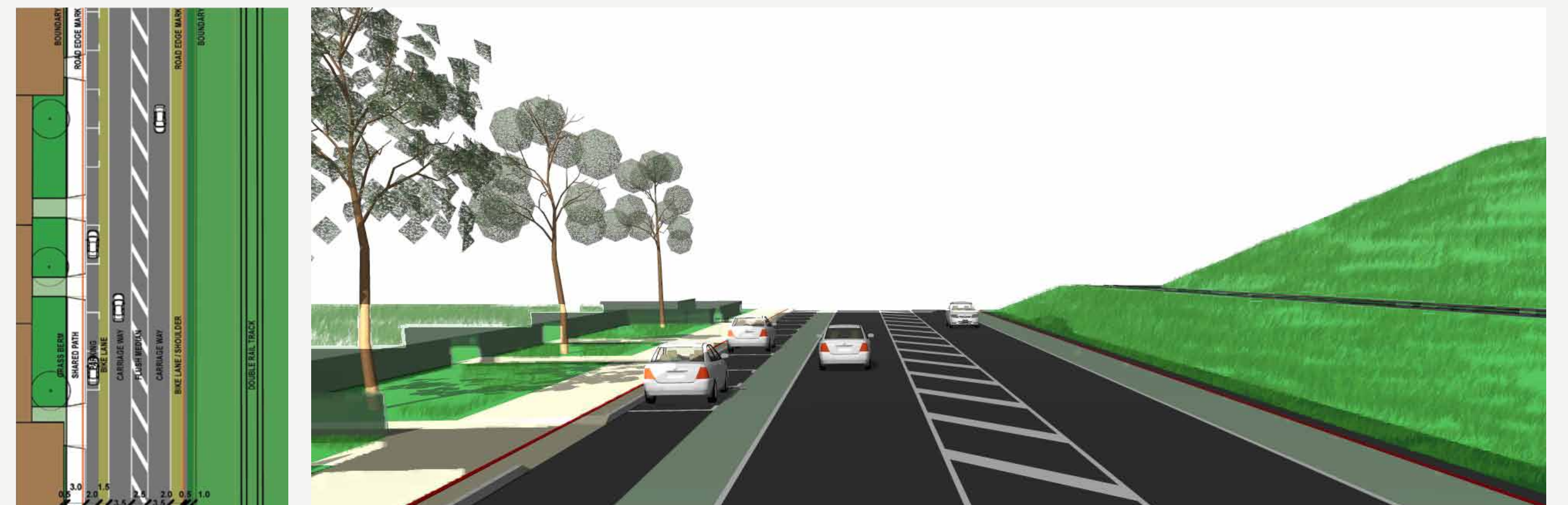
Parking kerbside and trees behind footpath