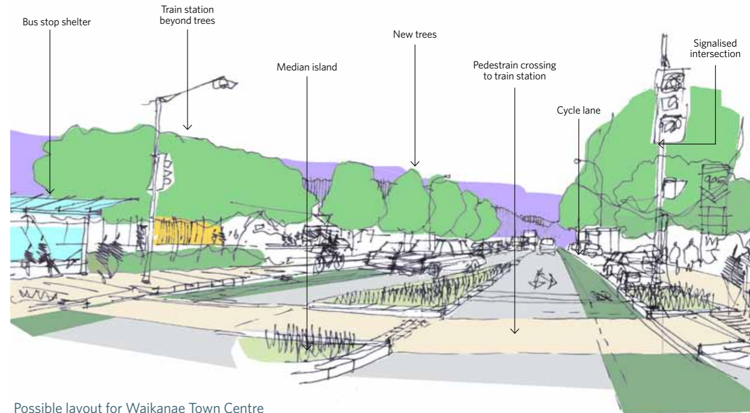
Possible layout for Waikanae Town Centre

Kāpiti Coast District Council and the NZ Transport Agency, are looking at how the current State Highway 1 between MacKays Crossing and Peka Peka can be modified when it becomes a local road managed by the Council. We would like your comments and ideas.