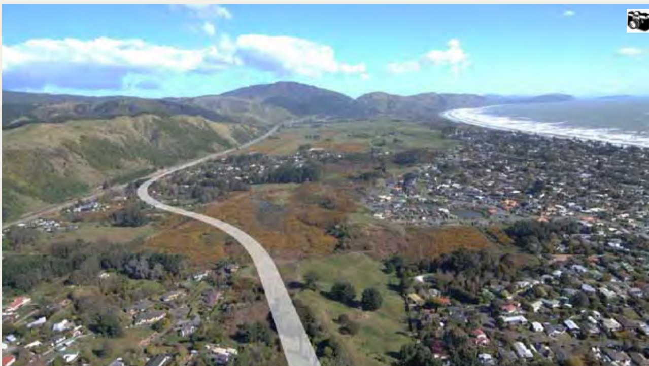
Indicative road carriageway alignment