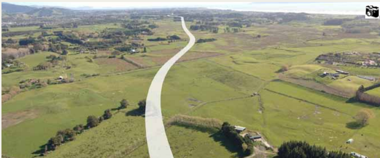
Indicative road carriageway alignment

We also considered taking the alignment east of the designation to avoid a wetland. However the wetland is not of such significance to outweigh the increased impact on adjacent properties.