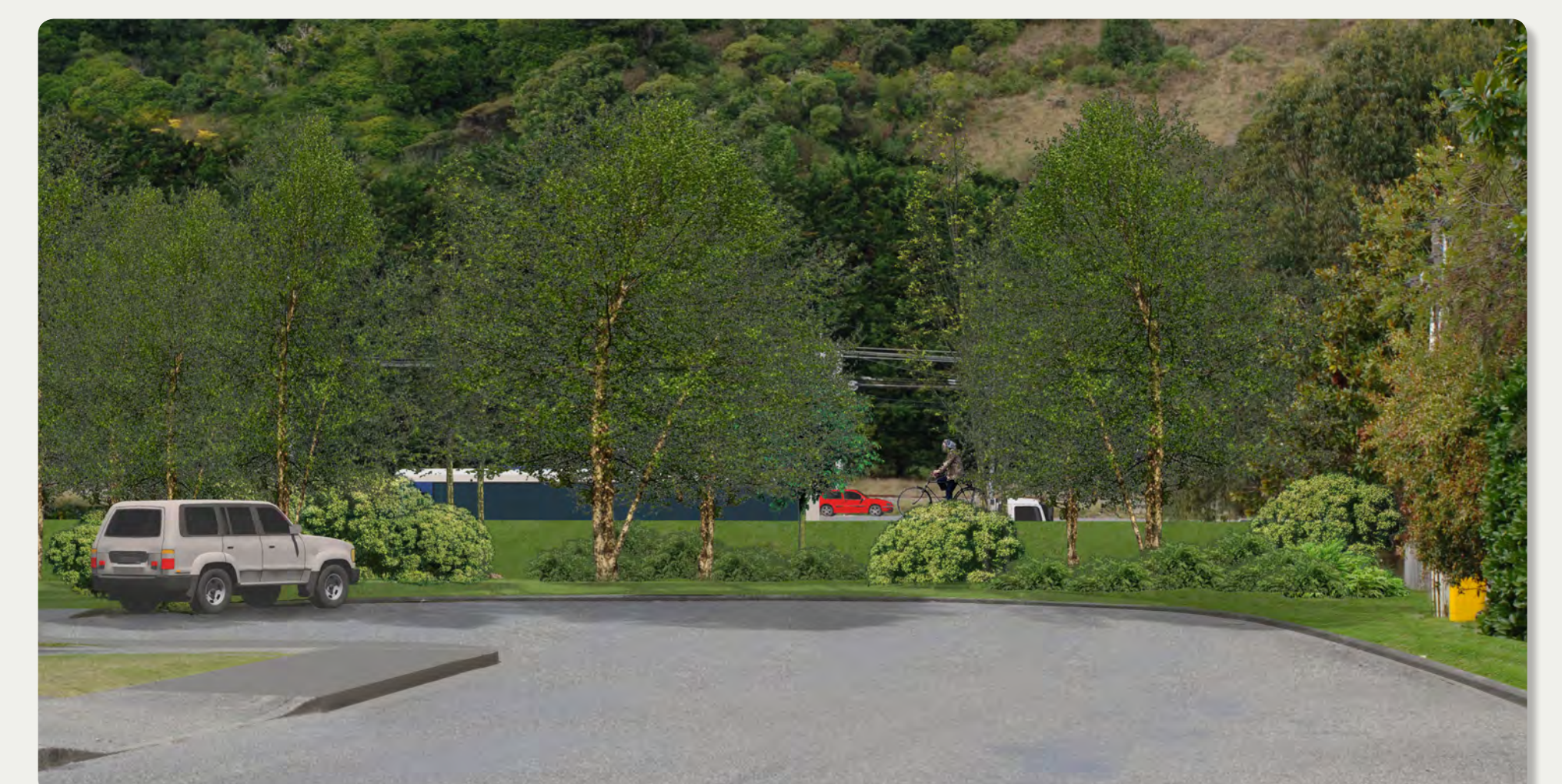
Indicative street level view looking to the end of Leinster Avenue.