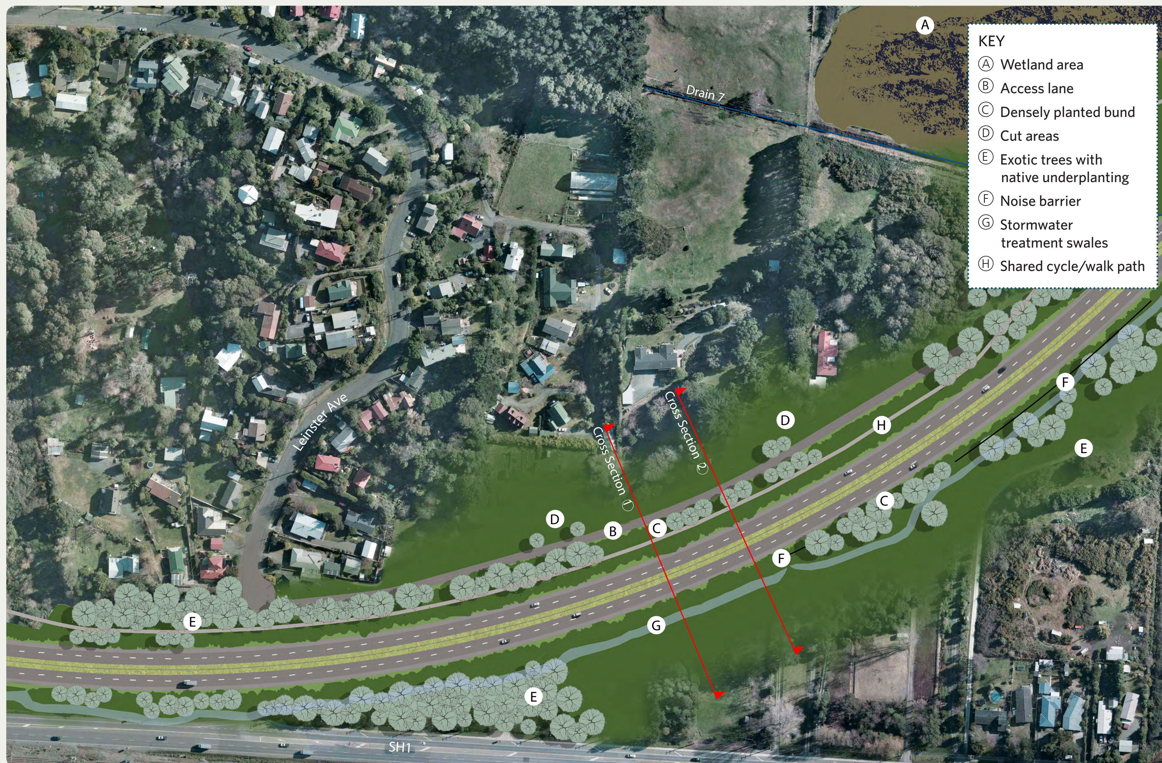
The indicative mitigation design includes the integration of landforms - bunds - to buffer residential properties from the expressway. A combination of dense native underplanting and taller exotic trees matches the existing planted landscape. Noise barriers will also be incorporated in some areas with their design to reflect the nearby property's purpose. The wetland areas will be retained and will have a stormwater management function.