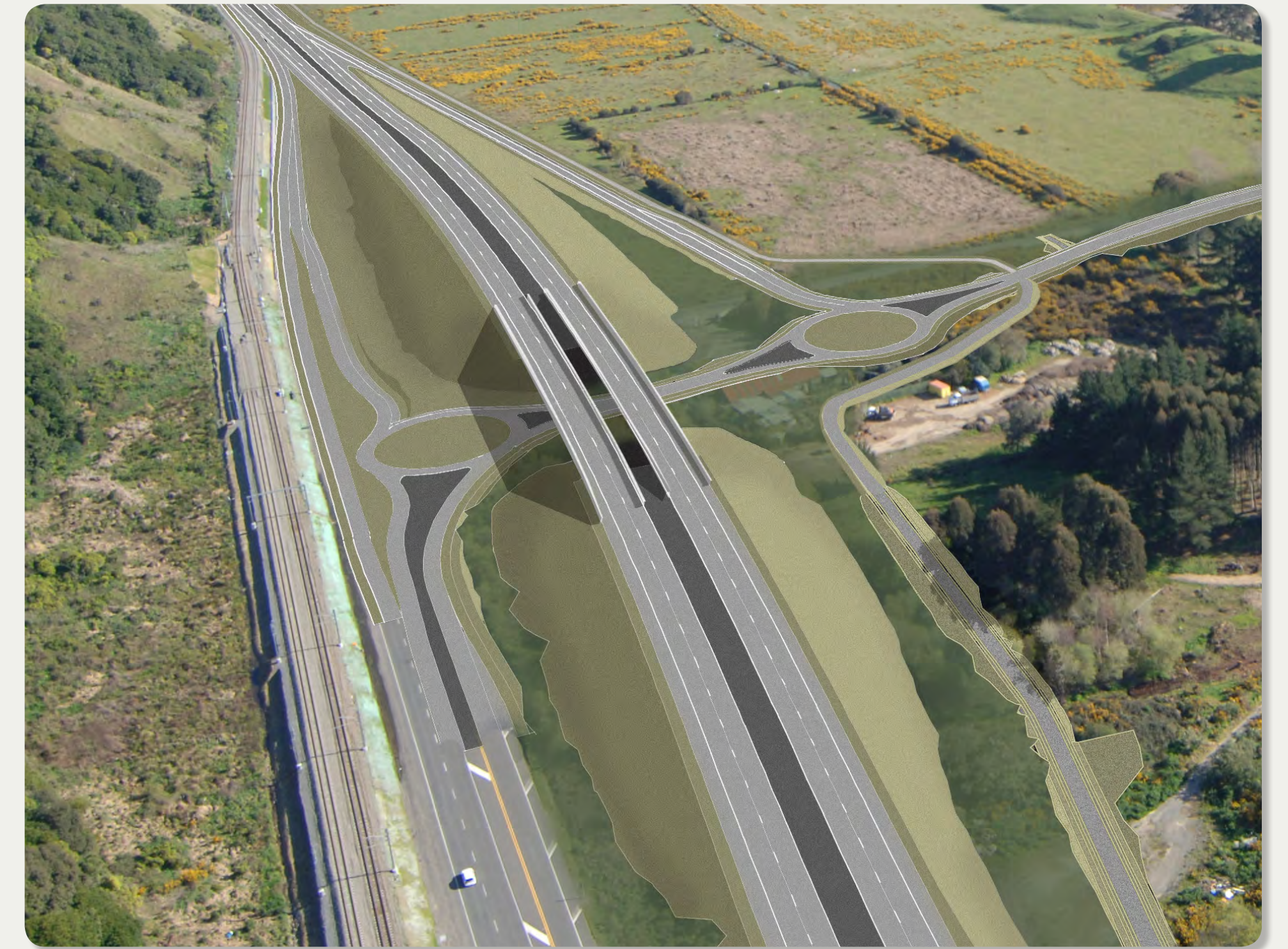
Indicative aerial view of the Poplar Avenue partial interchange looking south - before mitigation work.