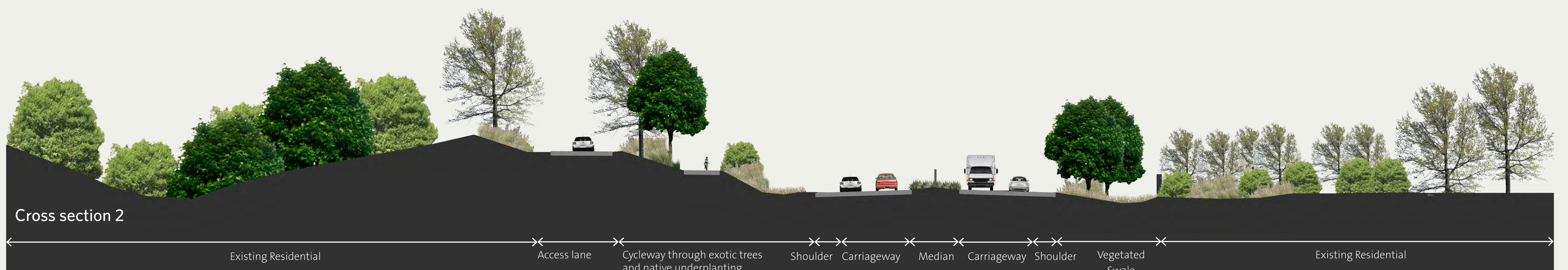
Indicative cross sections through the Leinster Avenue area showing existing residential properties to the left, through to the new expressway.