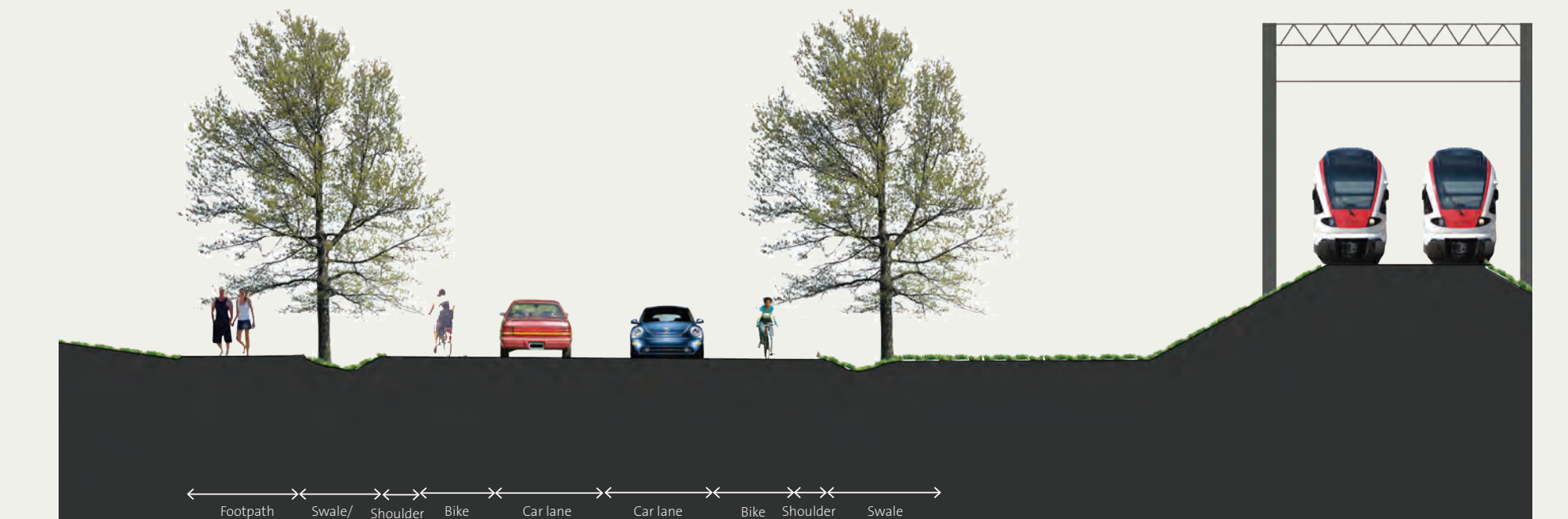
Indicative cross section in urban areas showing cycle lanes, trees, swales and narrowed road.