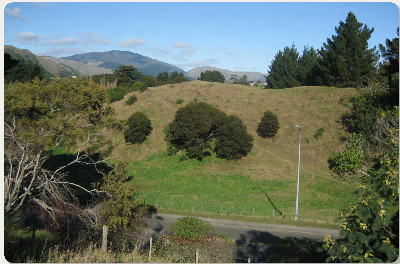
Dunes at Raumati Road - many of the dunes that originally dominated the coastal plains have been lost through urban and farming development.

Natural features such as dunes, wetlands, streams, and vegetation are distinctive elements along the route and combine to contribute to the sense of place.