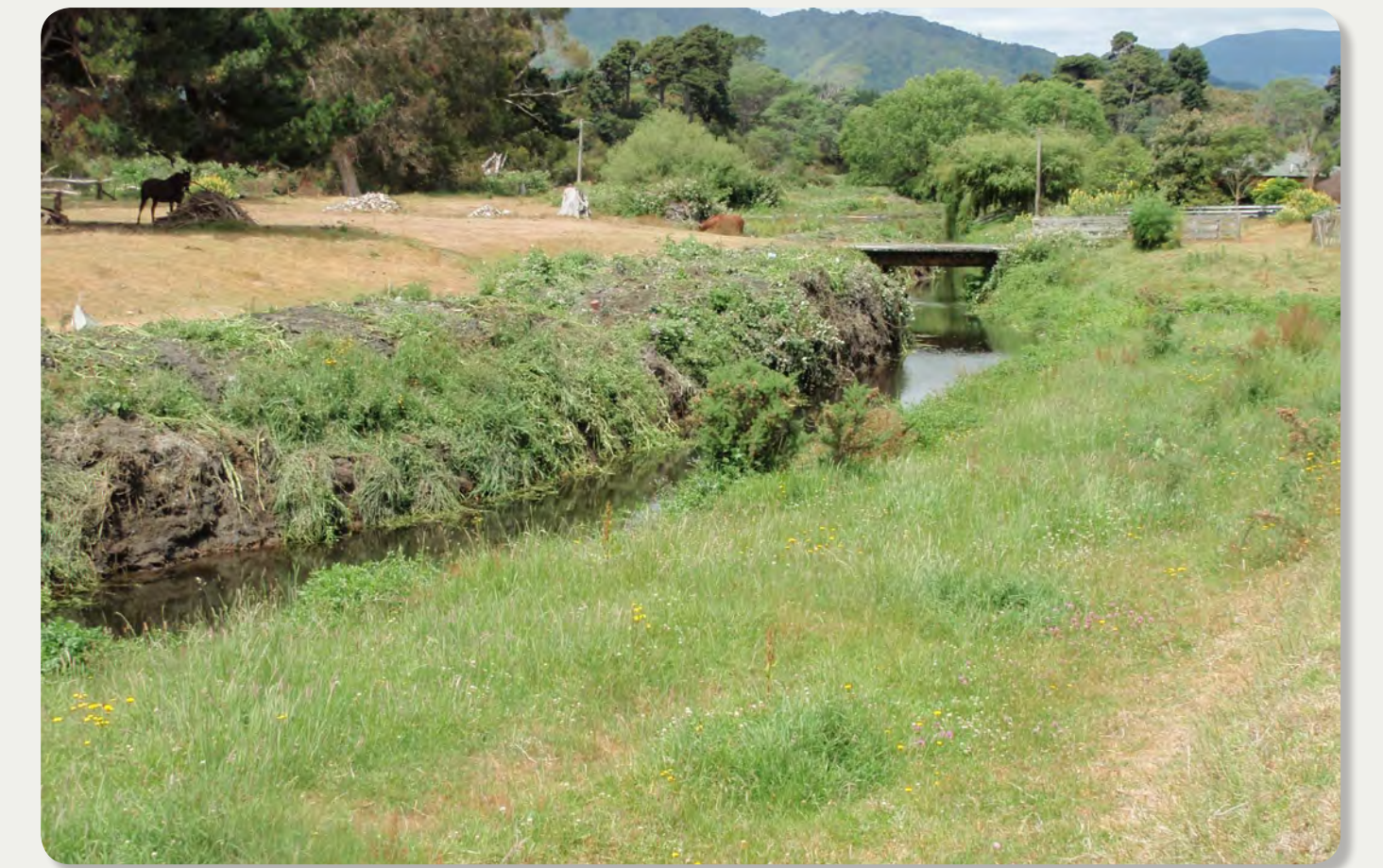
Waimeha Stream - many of the once meandering streams and wetlands have been channelled into narrow drains to assist the ability of the land to be farmed or urbanised.