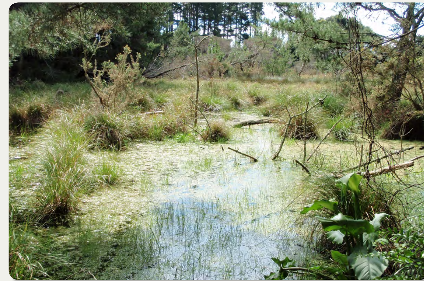
Wetlands at Otaihanga - some wetlands have degraded through weed infestation and poor quality water runoff.