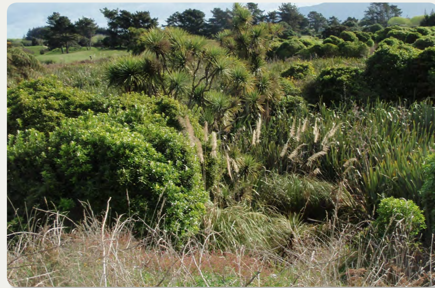
Vegetation - comprises a mix of exotic shrubland, pasture, shelterbelts and amenity tree planting, and small areas of young regenerating native vegetation.