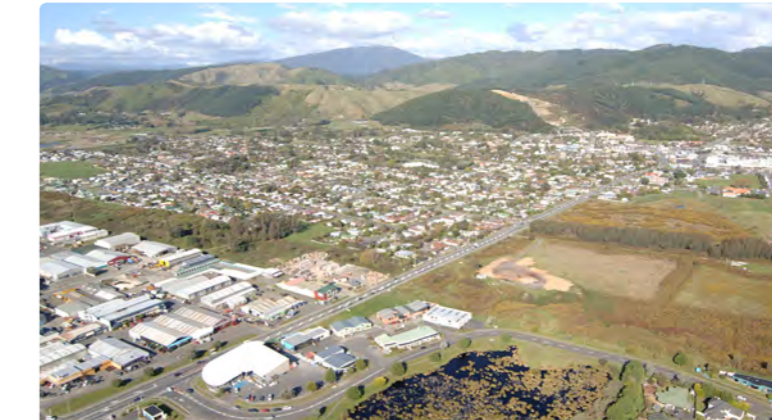
Aerial showing the Kāpiti Road interchange area

An interchange at Te Moana Road will achieve good connectivity between Paraparaumu and Waikanae by providing a second local crossing of the Waikanae River.