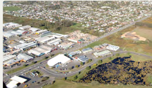
Economic - Access to town centres, freight and cost

National Providing for national roading infrastructure and design requirements of the roads of national significance.