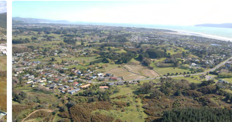
Aerial showing the Te Moana Road interchange area

The western alignment (Option 1 in the November proposals) has been confirmed, reducing the number of homeowners affected. The alternative would have required 25 houses and parts of an additional four properties. The selected option will require 11 houses and parts of an additional five properties. Further work will ensure that the design respects the cultural and archaeological significance of this area.