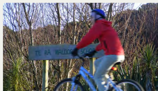
Social - Property and connected communities