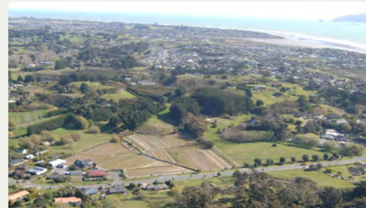
Cultural - Heritage sites, buildings, and wāhi tapu. Character, sense of place