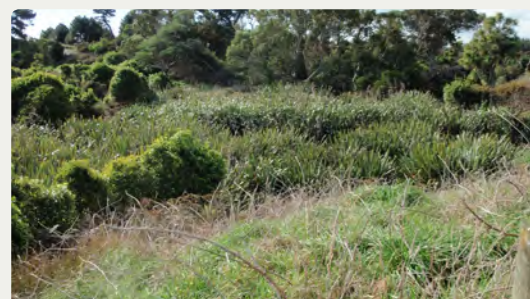
Environmental - Wetlands and dunes

In a project of this scale and complexity we need to make sure that decisions we make, achieve a balance of the following key factors: