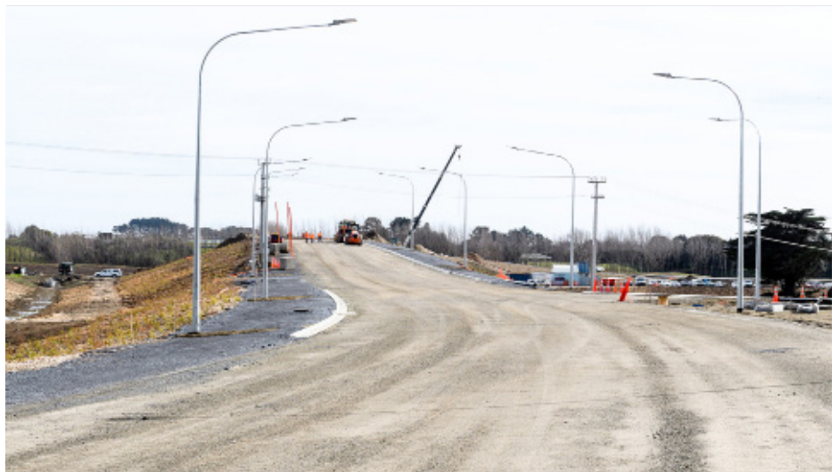
HEADING NORTH TOWARDS THE LINK ROAD BRIDGE AT PEKA PEKA

The re-route will be in place until the Expressway opens.