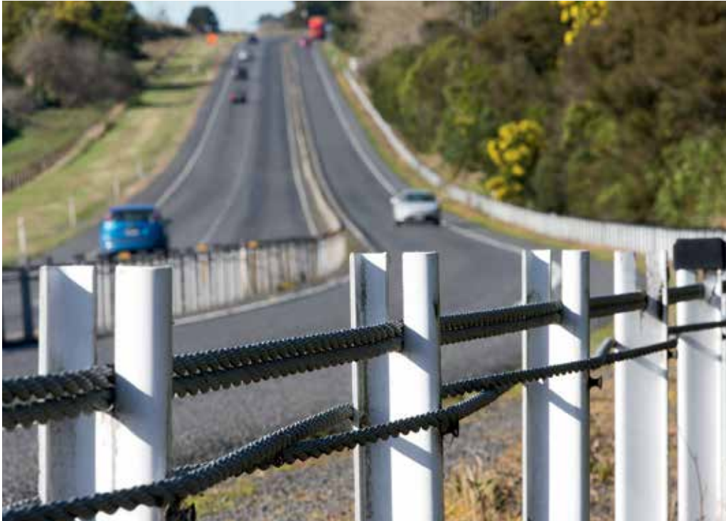
The Longswamp section involves widening the current State Highway 1 between the Hampton Downs interchange and the Te Kauwhata interchange to four lanes and creating a local road bridge over the Expressway.