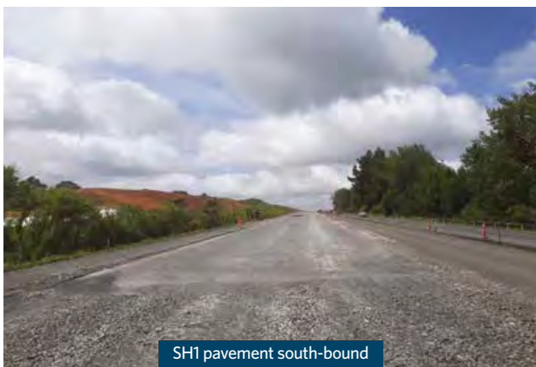
SH1 pavement south-bound