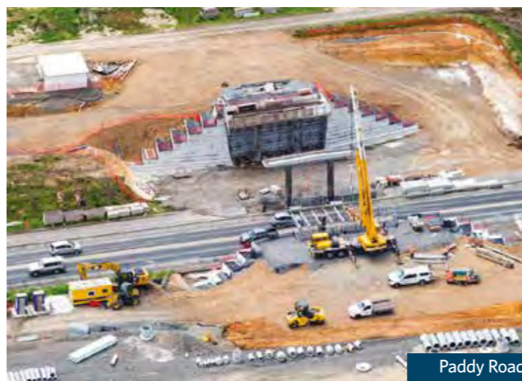
Paddy Road overbridge