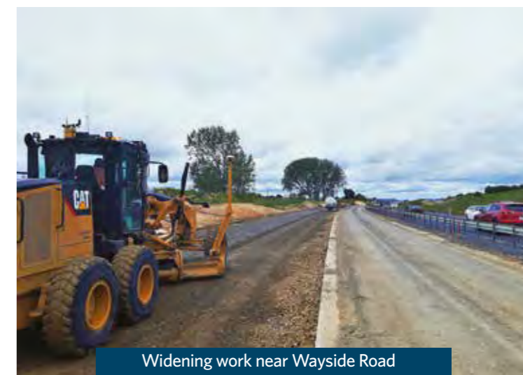
Widening work near Wayside Road