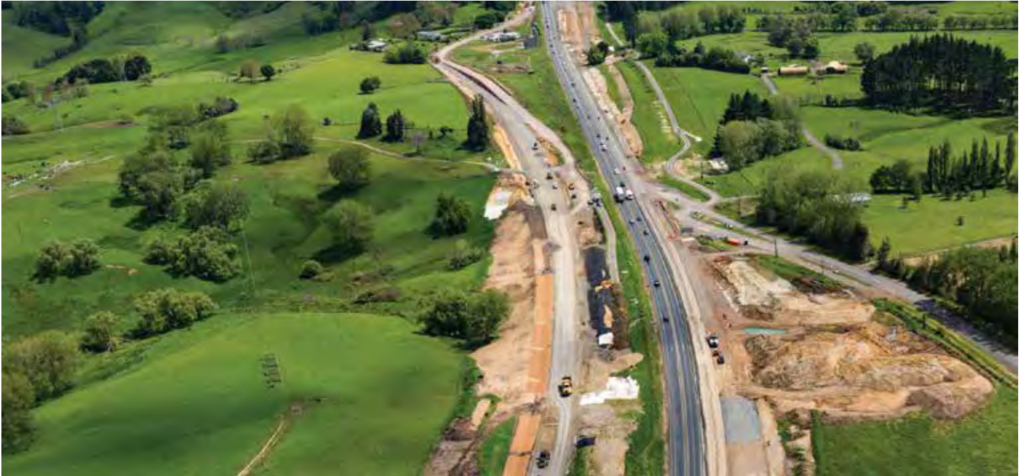
Work progresses on the Rodda Road extension, pictured here on the left of SH1, with Wayside Road on the right.