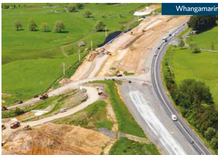
Whangamarino Road extension