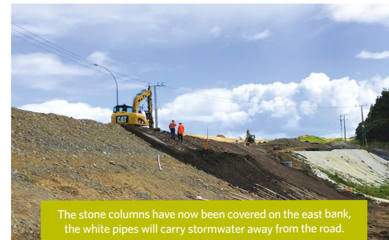
The stone columns have now been covered on the east bank, the white pipes will carry stormwater away from the road.