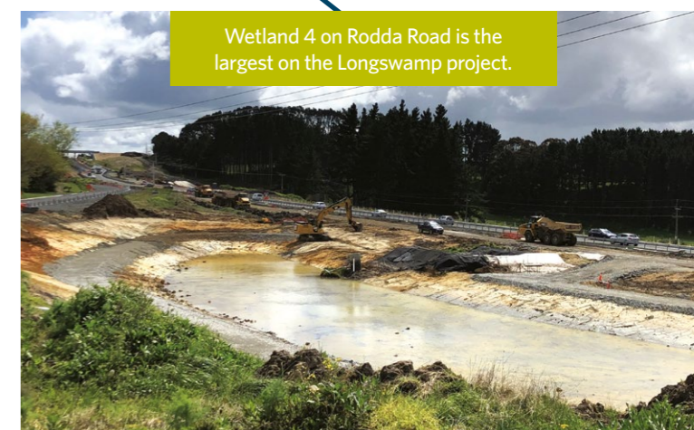
Wetland 4 on Rodda Road is the largest on the Longswamp project.