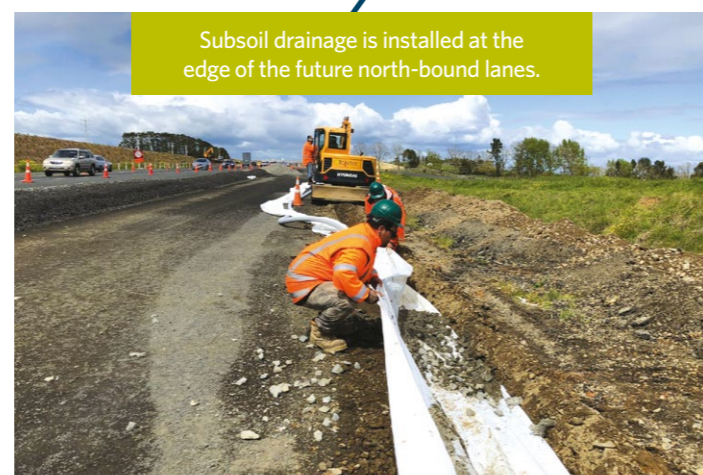
Subsoil drainage is installed at the edge of the future north-bound lanes.