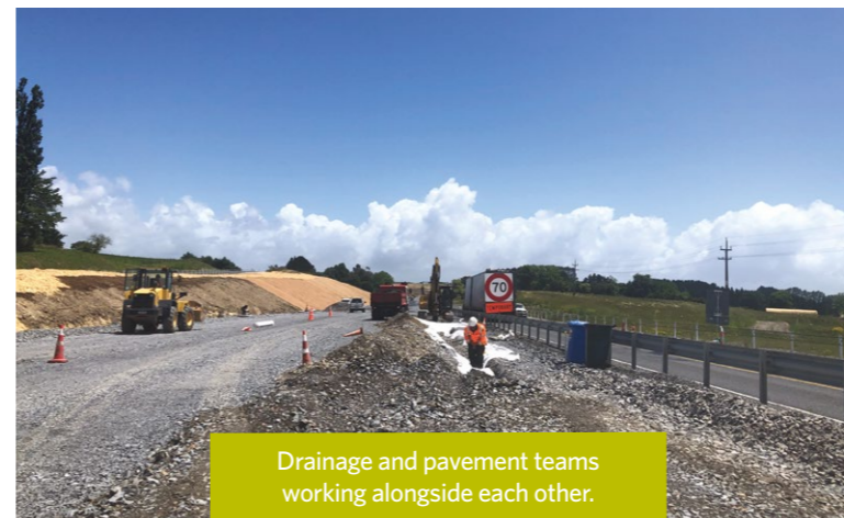
Drainage and pavement teams working alongside each other.