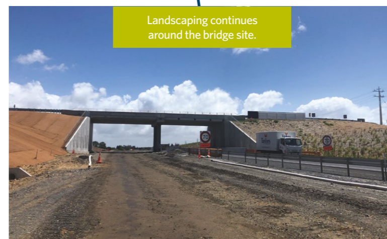
Landscaping continues around the bridge site.