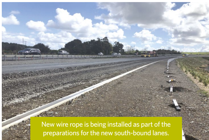
New wire rope is being installed as part of the preparations for the new south-bound lanes.