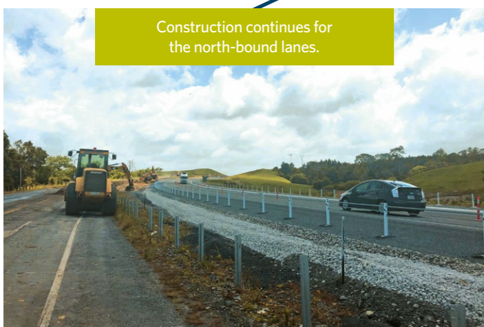
Construction continues for the north-bound lanes.