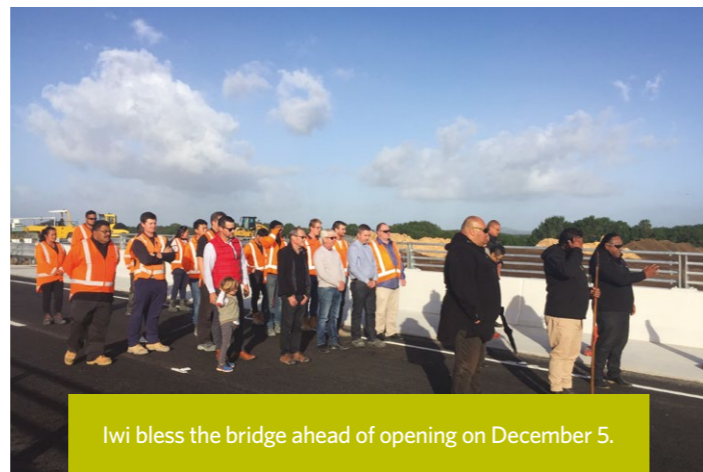
Iwi bless the bridge ahead of opening on December 5.