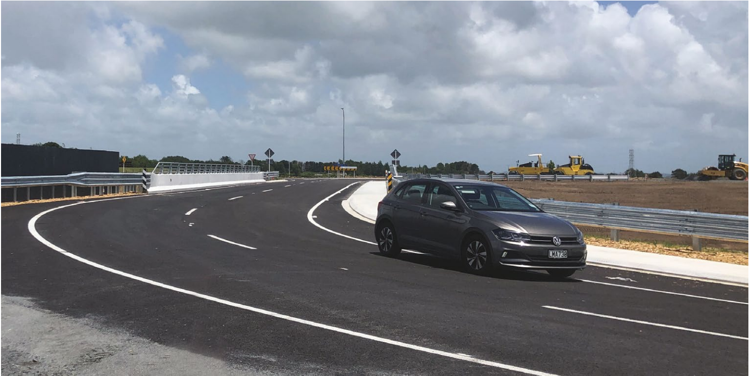
The Whangamarino Road bridge opened Wednesday 5 December