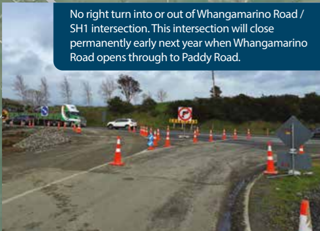
No right turn into or out of Whangamarino Road / SH1 intersection. This intersection will close permanently early next year when Whangamarino Road opens through to Paddy Road.