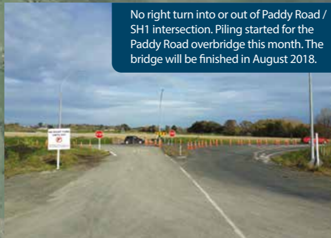
No right turn into or out of Paddy Road / SH1 intersection. Piling started for the Paddy Road overbridge this month. The bridge will be finished in August 2018.