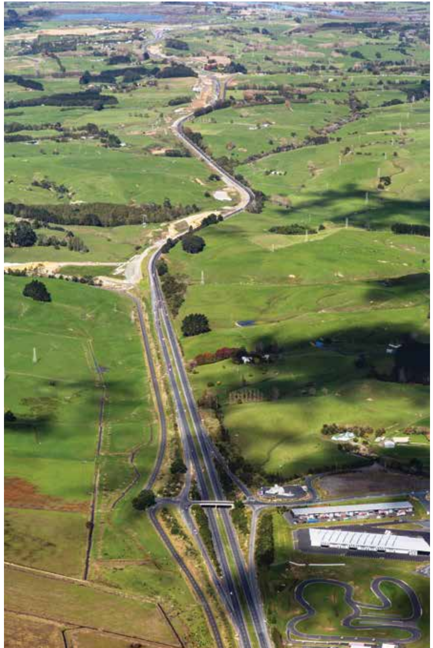
The Longswamp section looking south from Hampton Downs.

Downer has established a site office at 5 Paddy Road so please pop in and visit the team during working hours should you have any queries about the project.