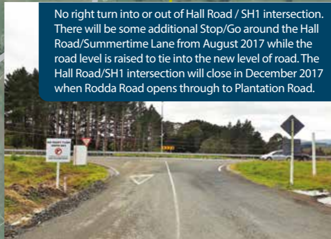
No right turn into or out of Hall Road / SH1 intersection. There will be some additional Stop/Go around the Hall Road/Summertime Lane from August 2017 while the road level is raised to tie into the new level of road. The Hall Road/SH1 intersection will close in December 2017 when Rodda Road opens through to Plantation Road.