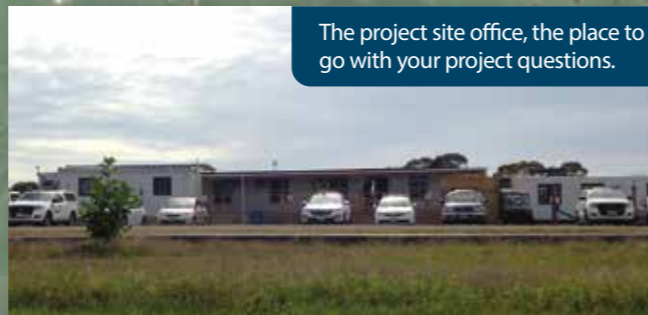
The project site office, the place to go with your project questions.