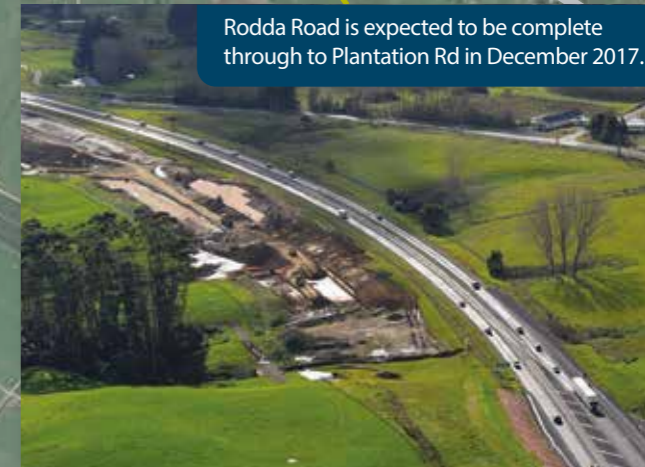
Rodda Road is expected to be complete through to Plantation Rd in December 2017.