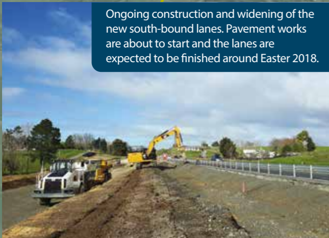
Ongoing construction and widening of the new south-bound lanes. Pavement works are about to start and the lanes are expected to be finished around Easter 2018.