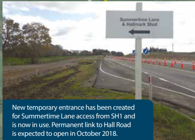
New temporary entrance has been created for Summertime Lane access from SH1 and is now in use. Permanent link to Hall Road is expected to open in October 2018.