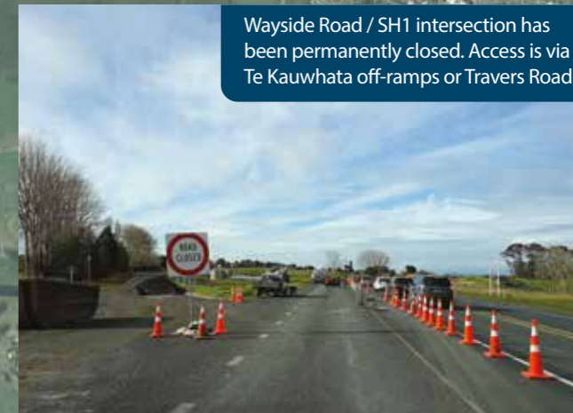
Wayside Road / SH1 intersection has been permanently closed. Access is via Te Kauwhata off-ramps or Travers Road.