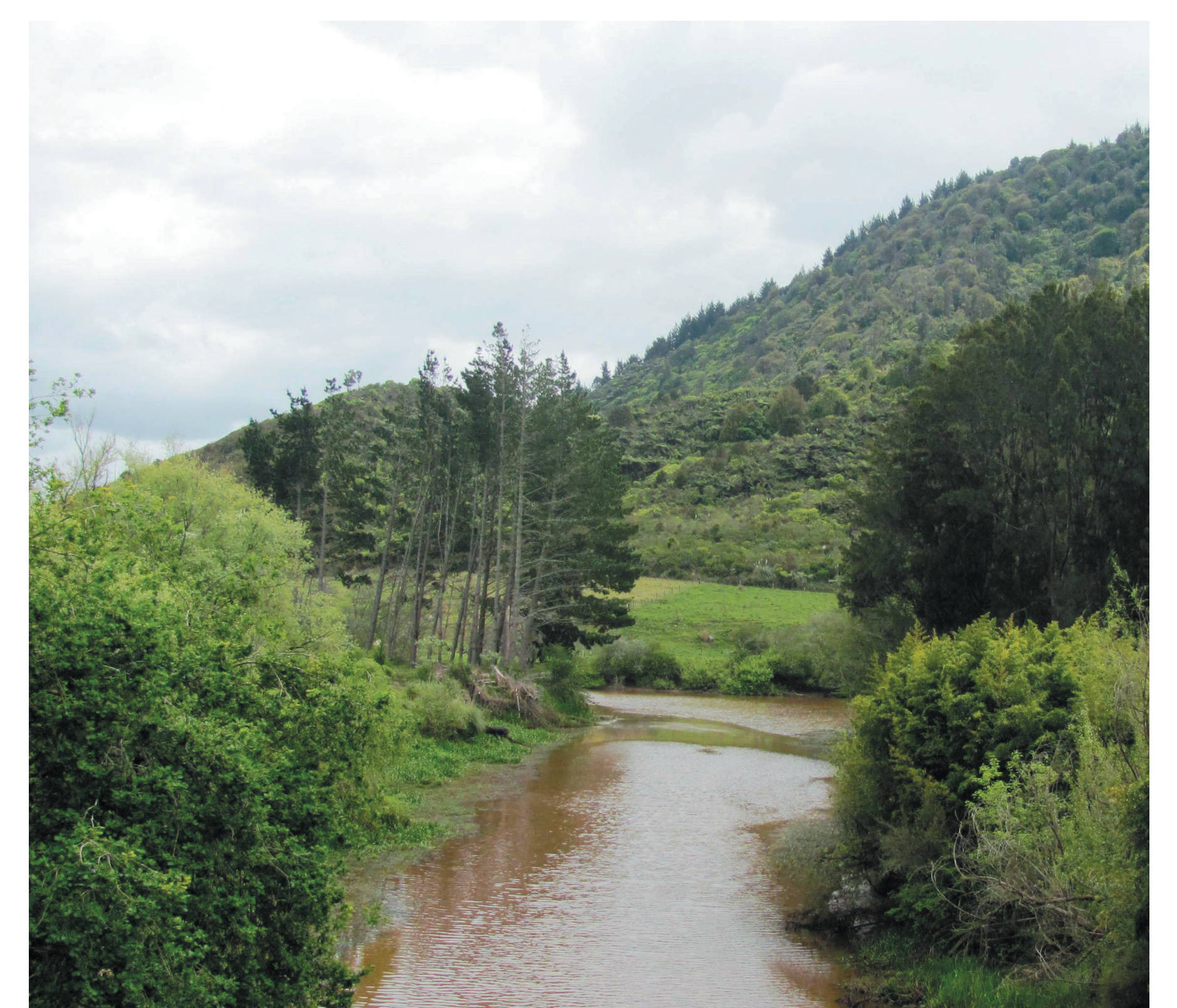
Mangawara inlet and Taupiri Maunga