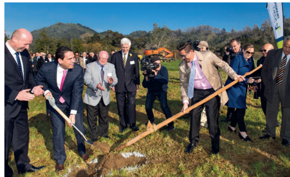
Transport Minister Simon Bridges turns the first sod alongside Maori King Tuheitia's eldest son, Whatumoana Paki

Work on the Huntly section of the Waikato Expressway officially started last month with Minister of Transport Simon Bridges turning the first sod.