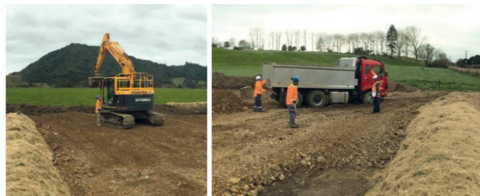
Ground preparation works on Waring Road for site huts

The focus for the team in September and early October has been the installation of erosion and sediment controls and fencing the project designation.