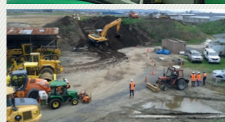
Staff undergoing training on site