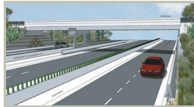
Orini Road overbridge