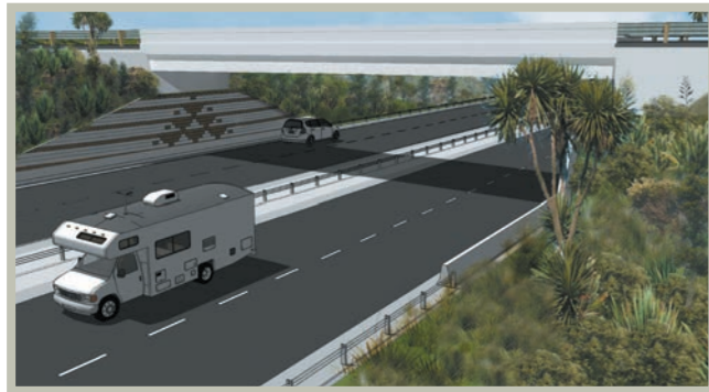
McVie Road overbridge