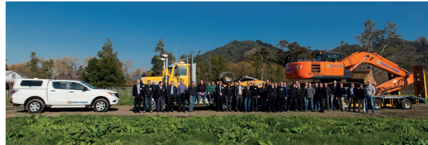
The Fulton Hogan HEB JV project team

Four bridges (North Island main trunk rail-bridge, Mangawara, Whangamaire, and Mangatuketoke) use both steel and concrete. They use weathering steel girders. Weathering steel has a longer life than normal steel and requires less maintenance with no need for painting. The bridge decks on these structures use precast concrete deck slabs which are prefabricated off site and transported to the project. The remaining bridges (Ralph, McVie, Orini, Waring and Komakorau) use precast pre-stressed super tee beams and will use insitu concrete deck slabs which means they are poured on site.