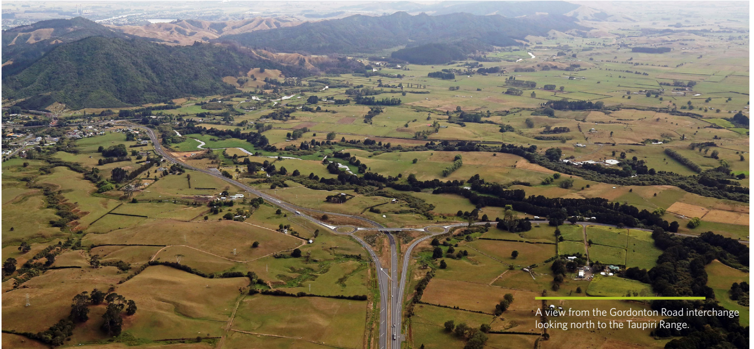
A view from the Gordonton Road interchange looking north to the Taupiri Range.