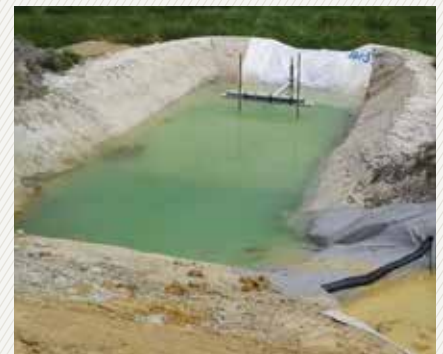
A decanting earth bund.

Fulton Hogan-HEB Joint Venture were also finalists in the International Erosion Control Association Environmental Excellent Awards held recently.