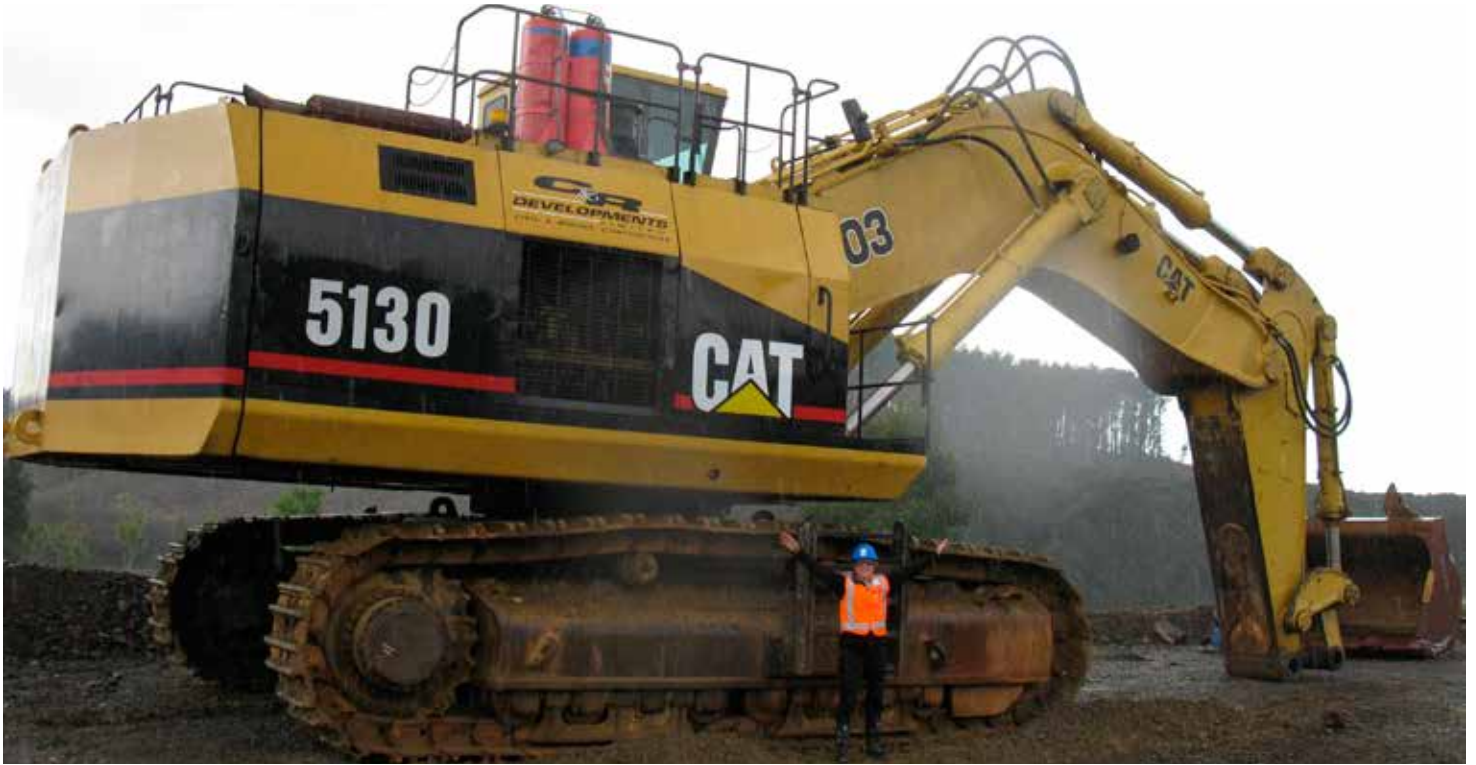
Stakeholder liaison manager for Fulton Hogan-HEB, Trish Viall, is dwarfed by a giant excavator now on site. It weighs 180 tonnes, and needed seven trucks to transport it in pieces for reassembly. The bucket takes 25 tonnes on earth with each bite.