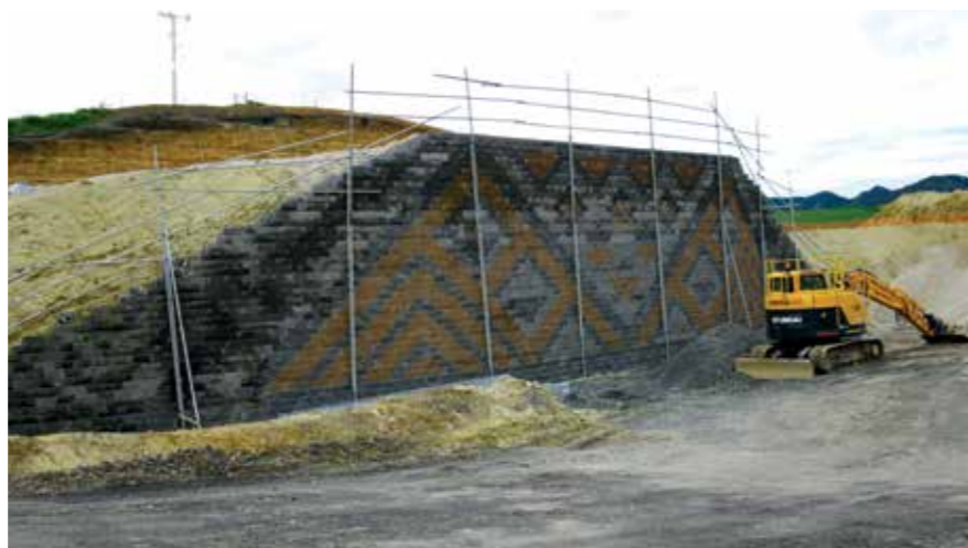
The Ralph Road bridge eastern MSE wall.

MSE walls are heavy duty retaining walls generally made of heavily compacted earth. The layers of fill also include an engineering grid which reinforces or stabilises the fill meaning the embankments can withstand greater loads.