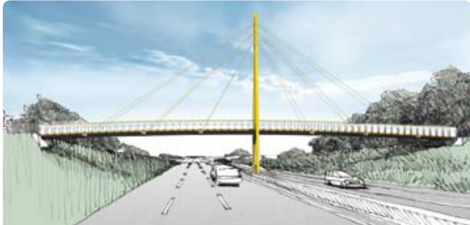
CLARKS LANE BRIDGE a two metre wide cable-stay footbridge for pedestrians and cyclists will give access over the motorway.