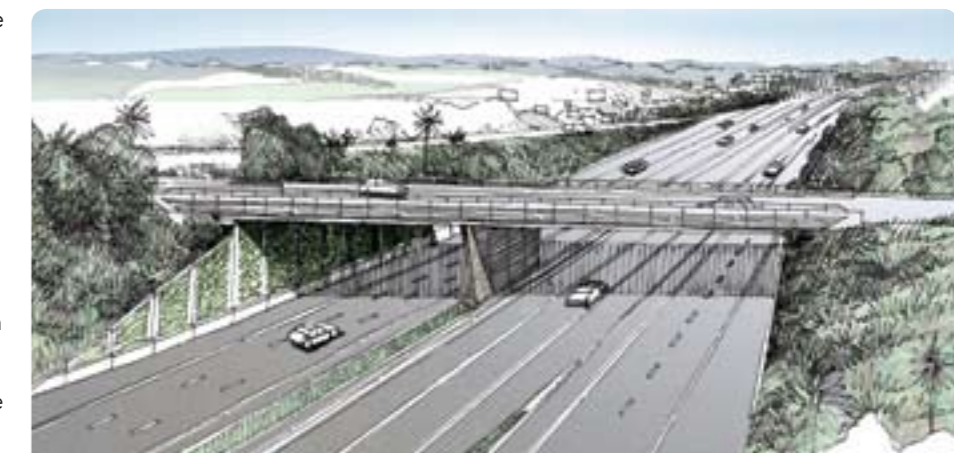
ARTIST'S IMPRESSION of the new Hobsonville Road Bridge.