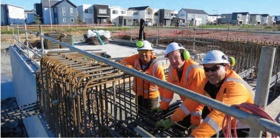
The structures team prepare reinforcing steel for the next concrete pour during construction of the walking/cycling underpass.

A walking and cycling underpass for the Resolution Drive extension has been built offsite and was recently lifted into place by crane. This will run under the road and connect the Tennille Street community with a network of shared walking/cycling paths.