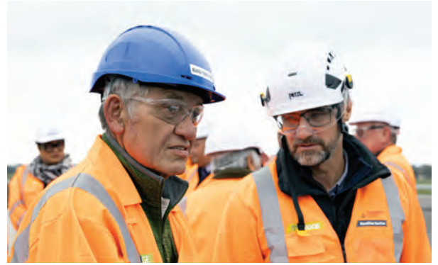
Kiingi Tuheitia viewed the cultural reserve during a recent site visit. He is pictured with Bruce Waugh, Waka Kotahi's Client Interface Manager.

The borrow pit in this reserve is the only one that remains after construction of the new Waikato Expressway. Early archaeological investigations showed the likely presence of a large complex of borrow pits, fireplaces and garden features.